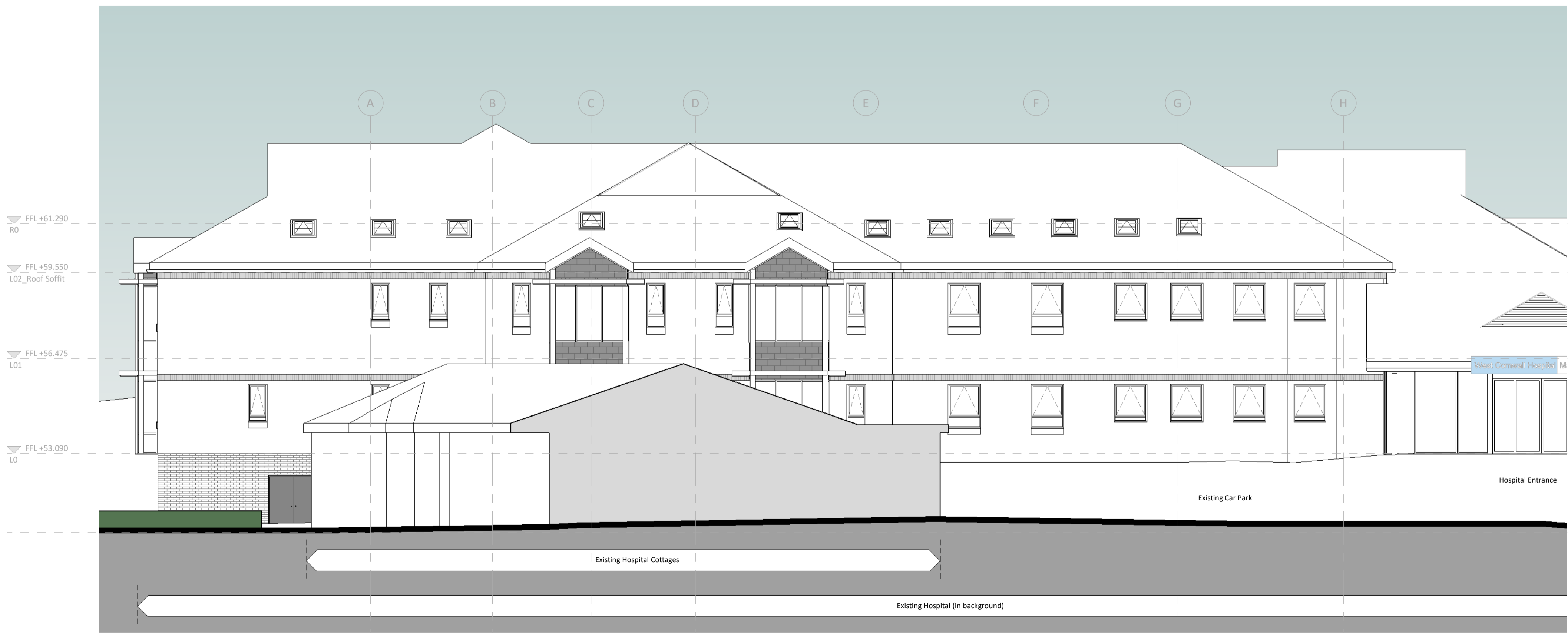
South East Elevation D - Existing 1:100