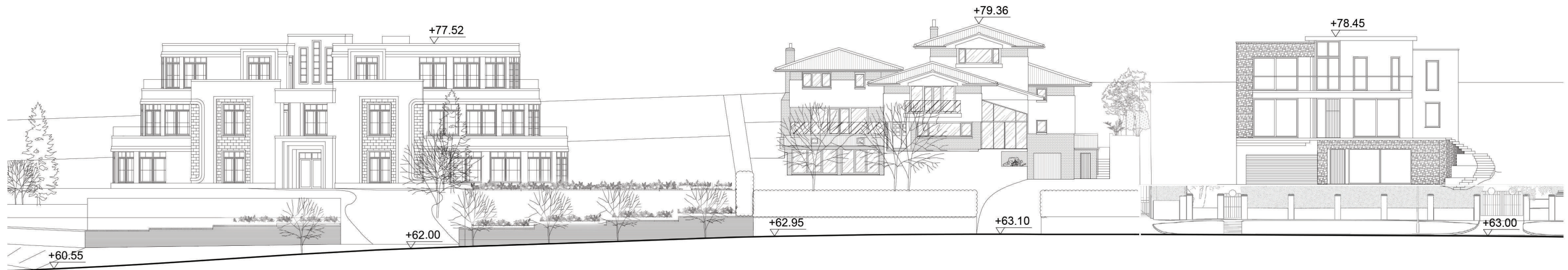
Existing No. 5 Roedean Street Elevation