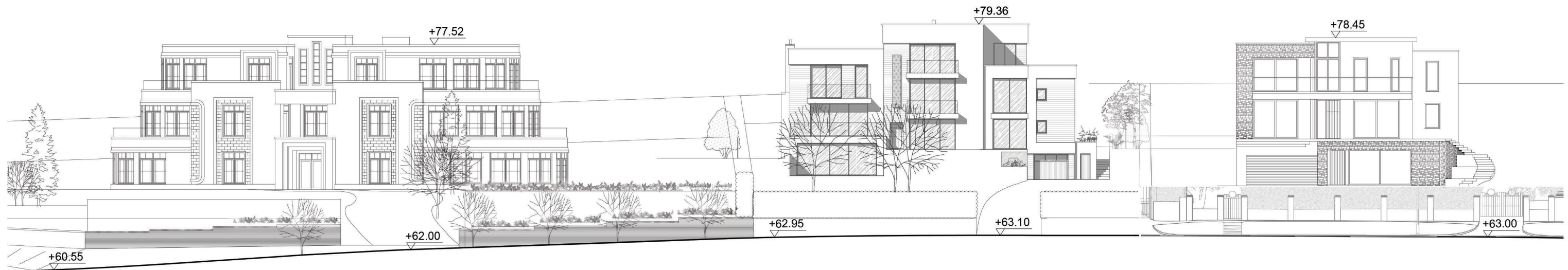
Proposed No. 5 Roedean Street Elevation