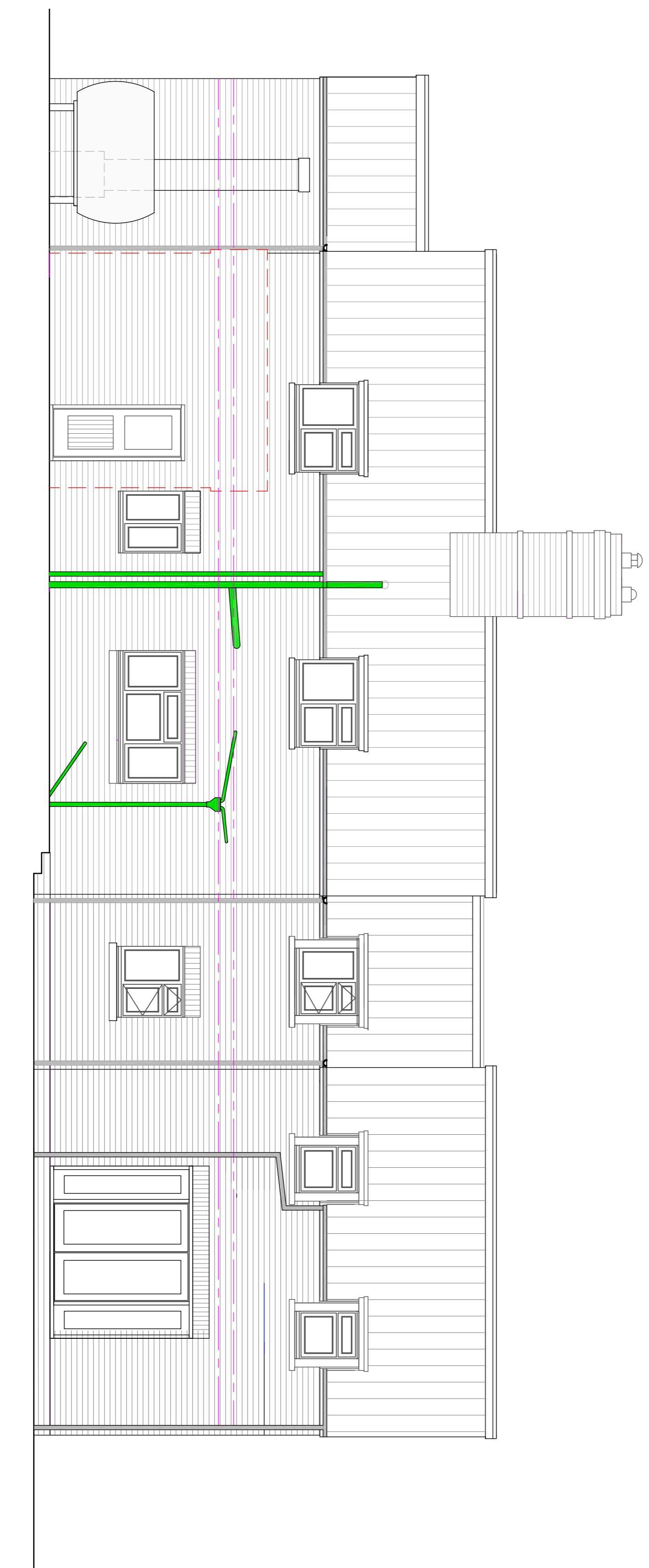
REAR ELEVATION - Looking South