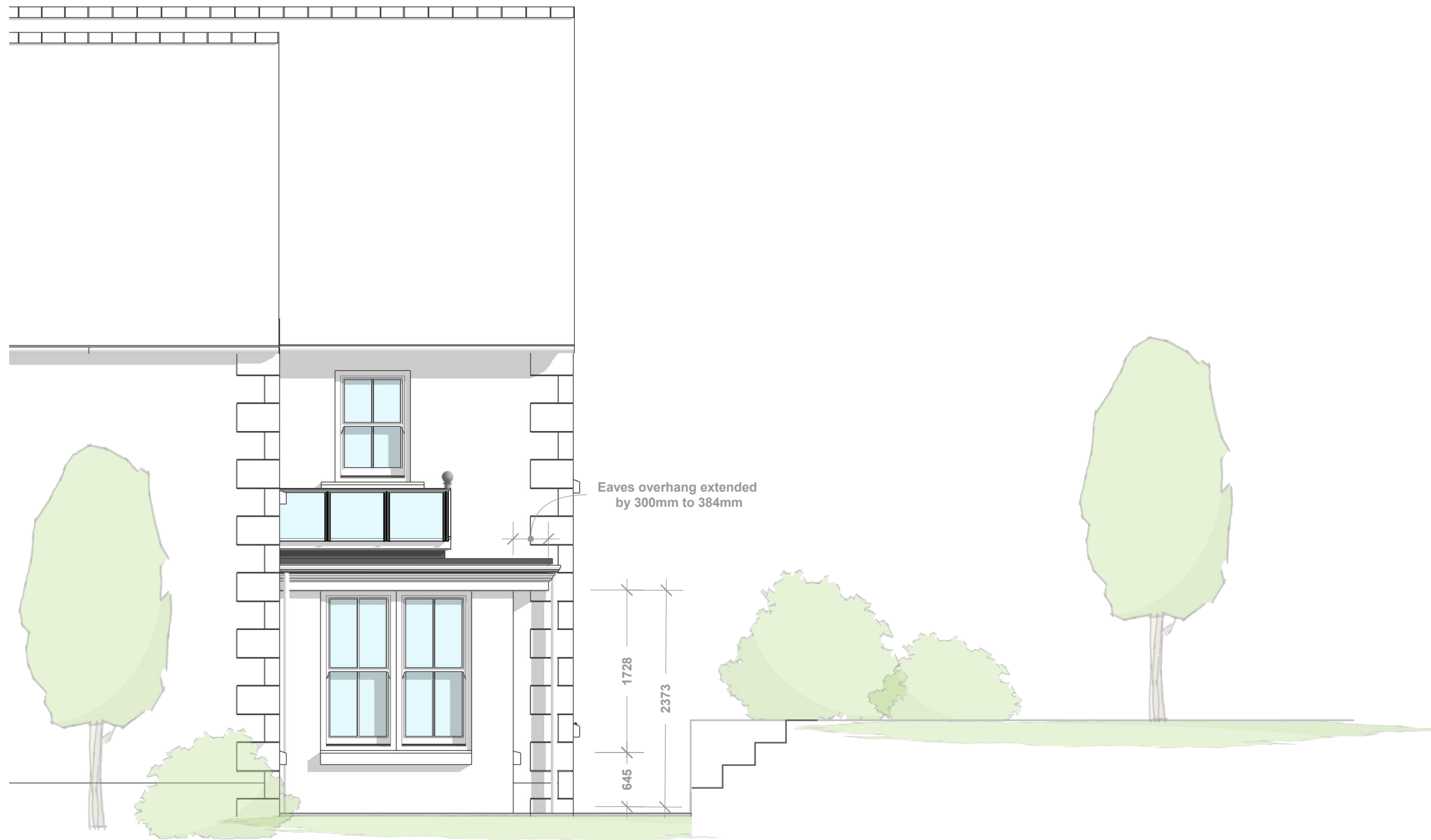
Proposed Left Elevation