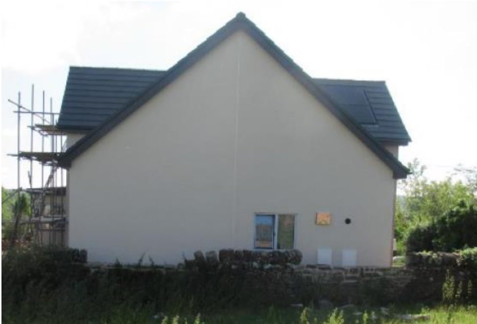
West Elevation of Sunnyside