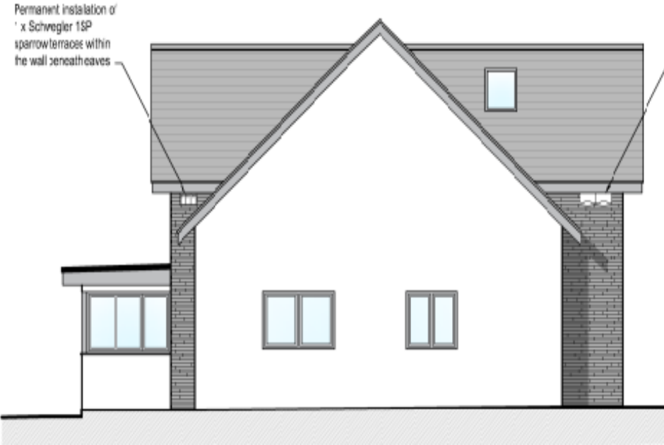
Elevations dwg. No. 201