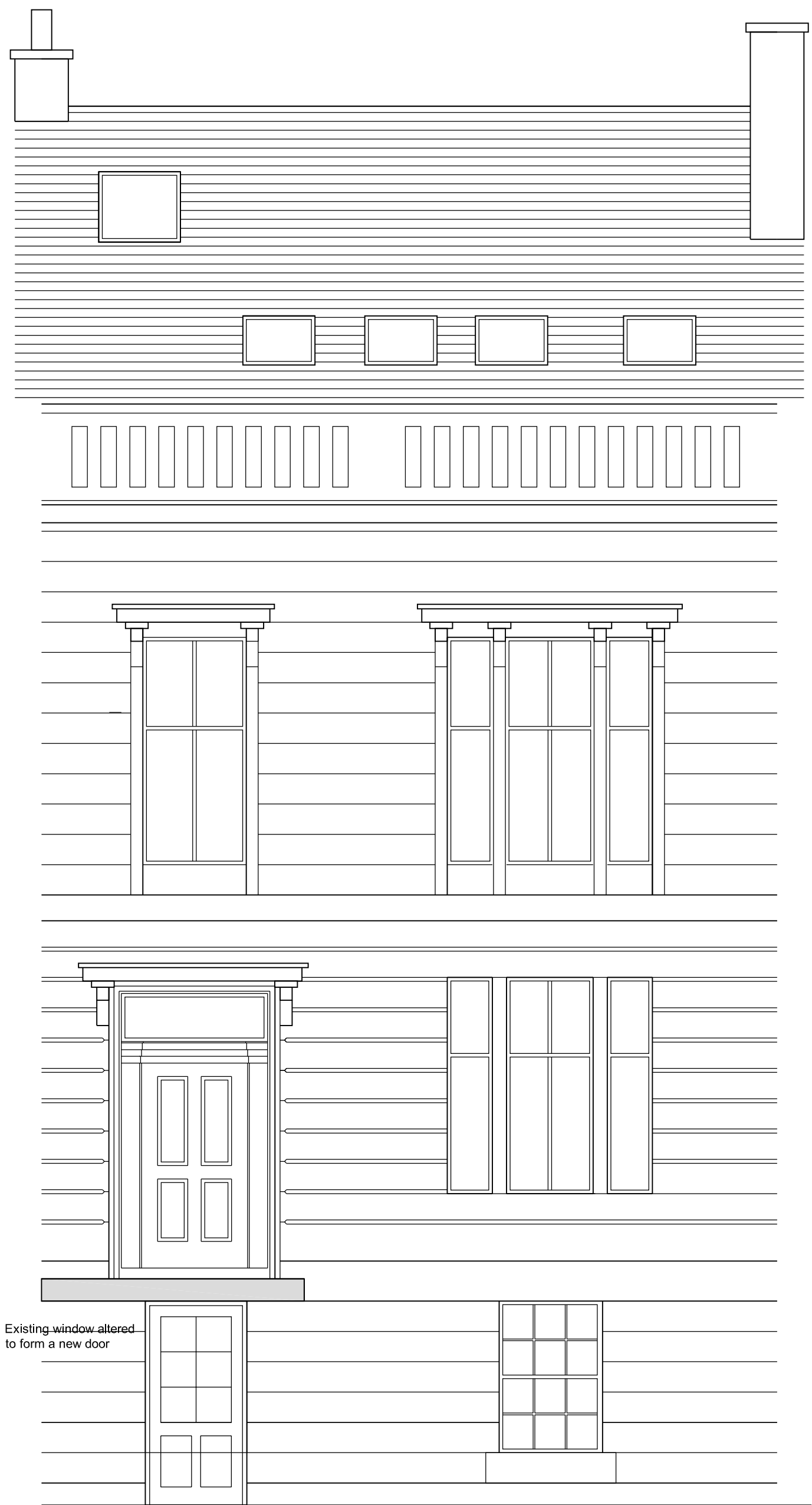
Elevation to front: Proposed