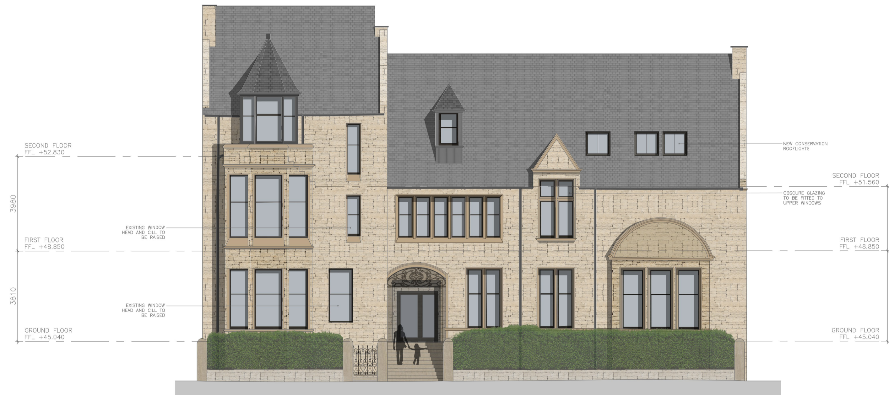
ELEVATION 1 (FRONT)