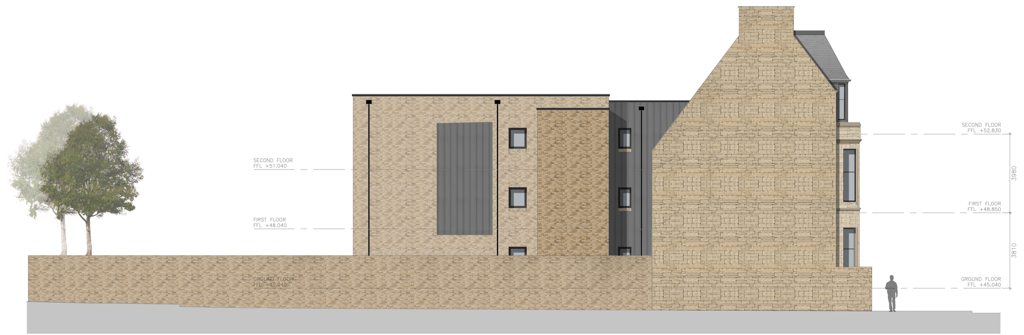
ELEVATION 2 (SIDE)