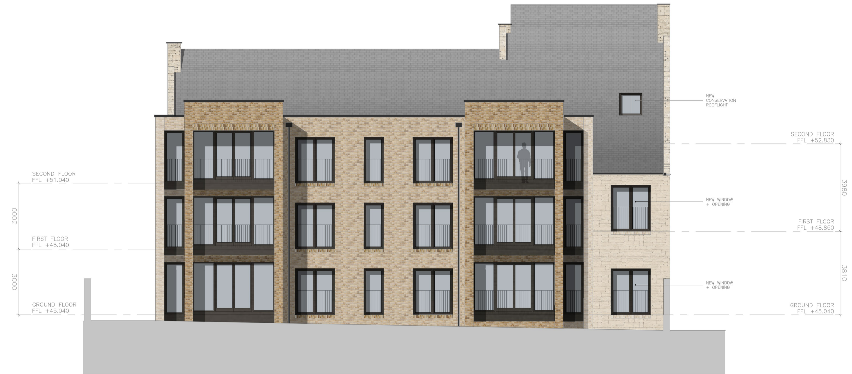
ELEVATION 3 (REAR)