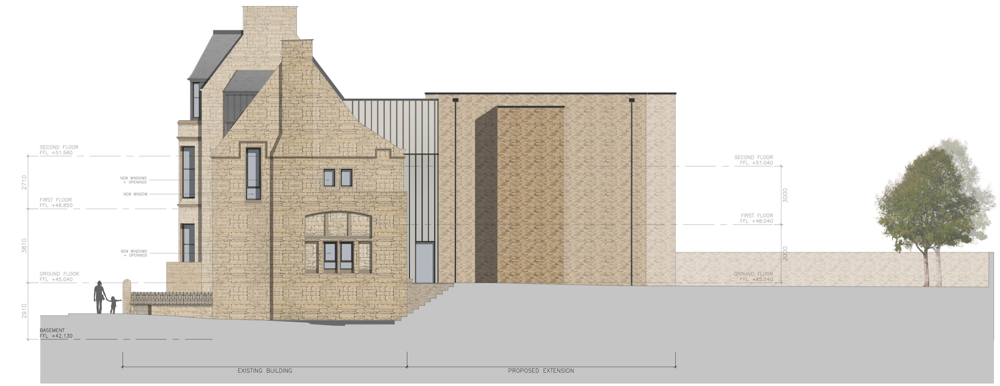
ELEVATION 4 (SIDE)