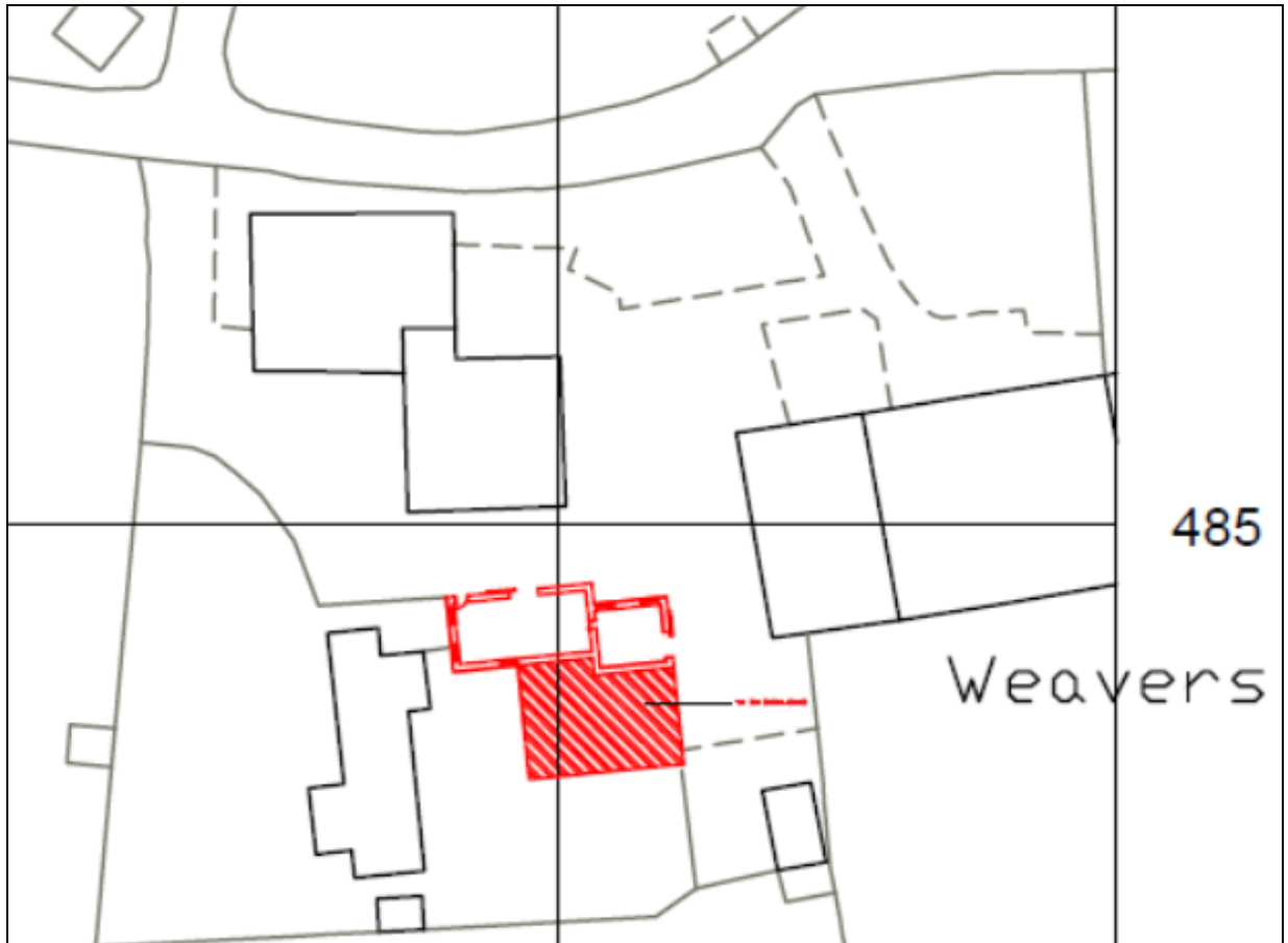
Map 1. The application building

The subject of the record is the barn at Weavers Farm, Weavers Lane, Cabus, in the borough of Wyre, Lancashire.