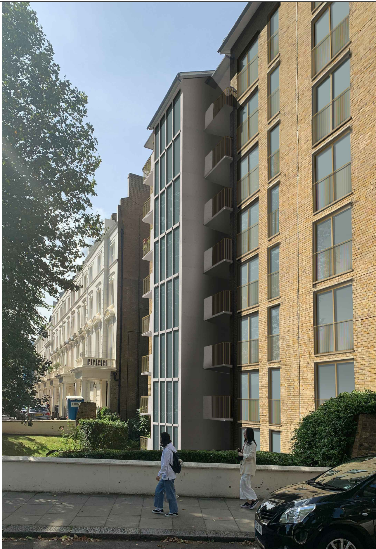
Proposed Street view 1906-206

USE FIGURED DIMENSIONS ONLY, DO NOT SCALE FROM THIS DRAWING. ALL DIMENSIONS MUST BE CHECKED ON SITE AND ANY INCONSISTENCIES MUST BE REPORTED BACK TO THE ARCHITECT. THIS DRAWING AND ANY DESIGNS INDICATED THEREON ARE THE COPYRIGHT OF 'OBITER ARCHITECTURE'. ALL RIGHTS ARE RESERVED. NO PART OF THIS WORK MAY BE PRODUCED WITHOUT PRIOR PERMISSION IN WRITING FROM 'OBITER ARCHITECTURE' ARCHITECTS. PLANNING STAGE DRAWINGS SHOULD NOT BE USED FOR CONSTRUCTION.