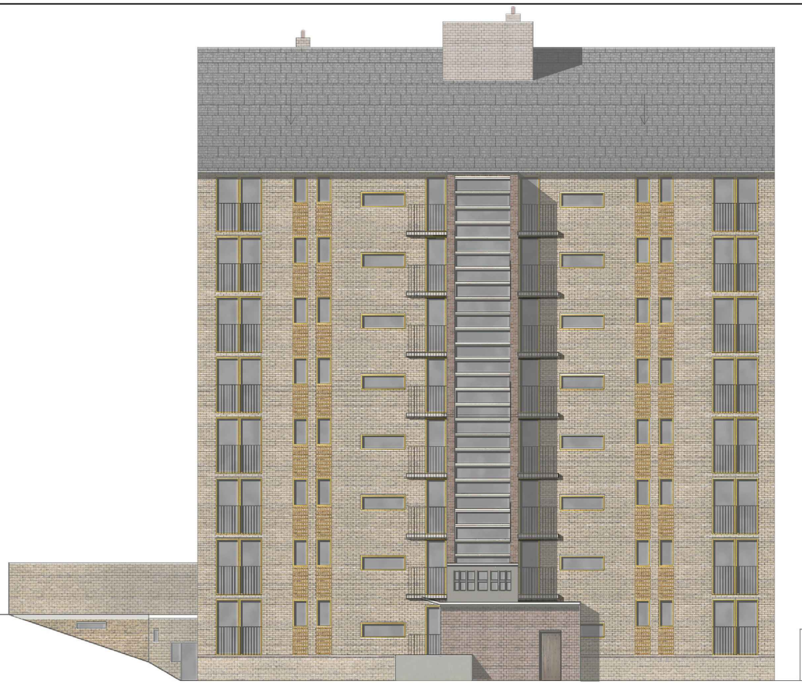
Proposed Rear Elevation 1906-203