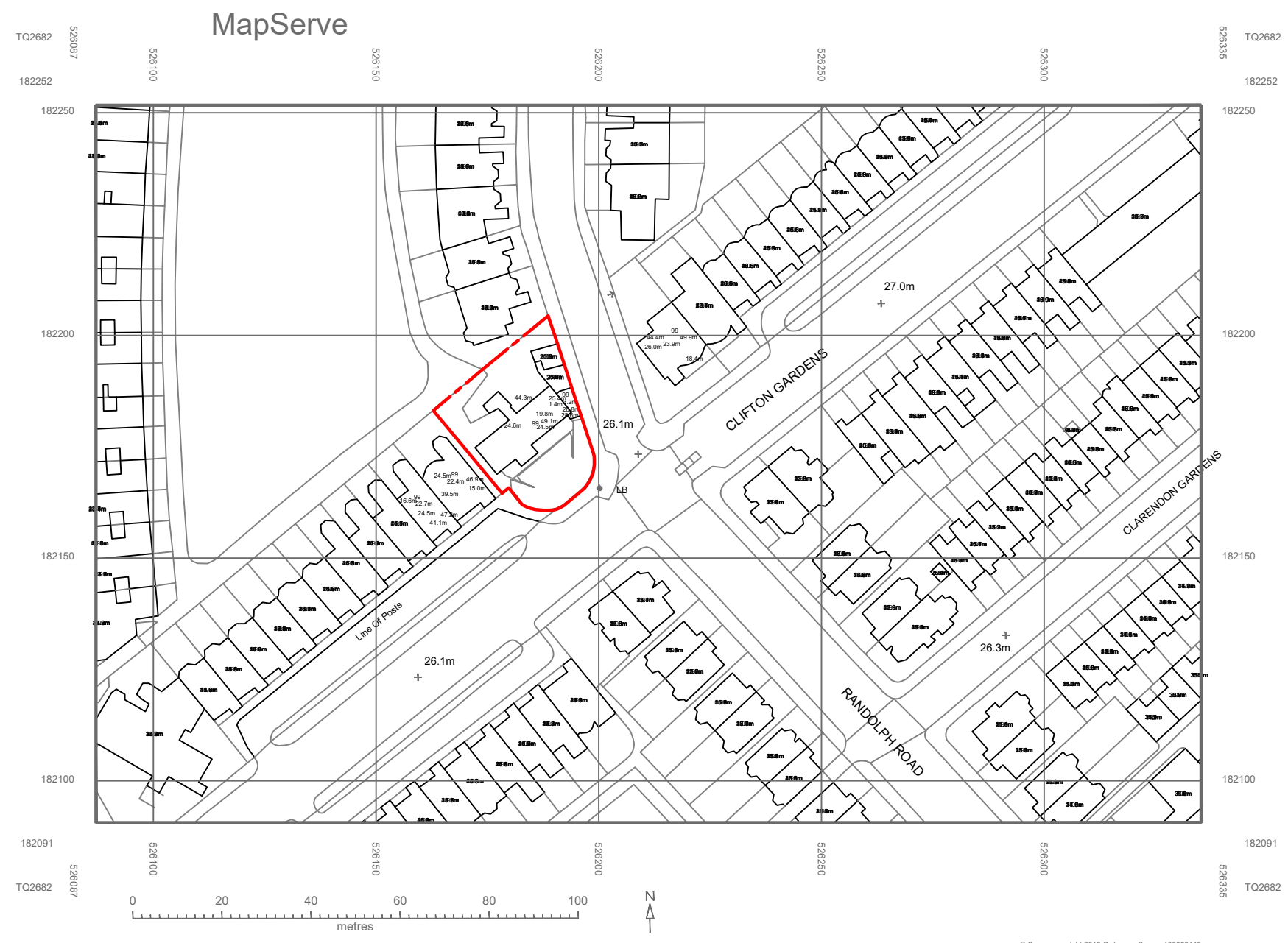
Site Plan 1906-001