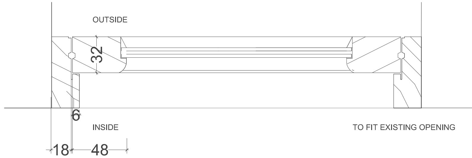
Proposed Window W09 Detail @ 1:2