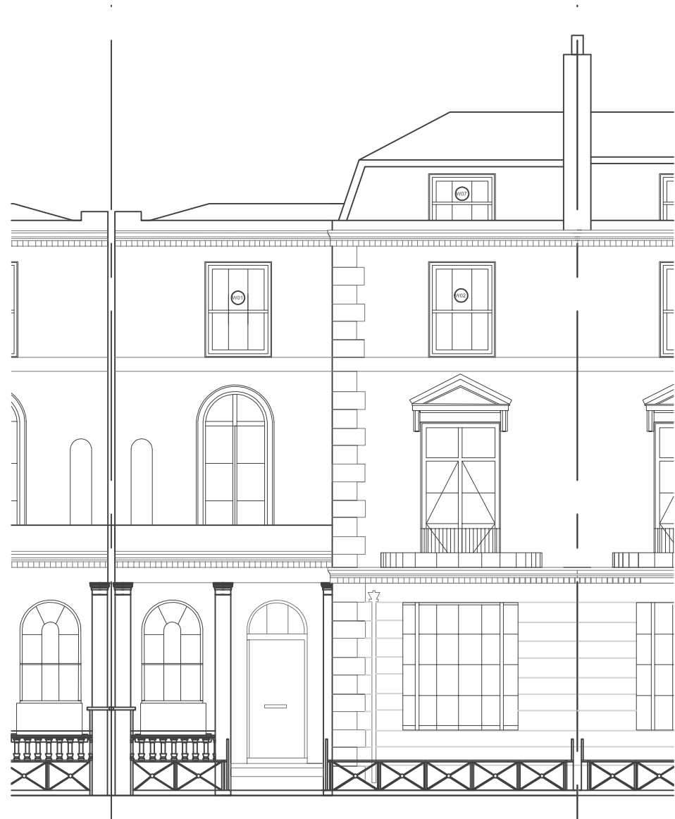
Existing Front Elevation @ 1:100