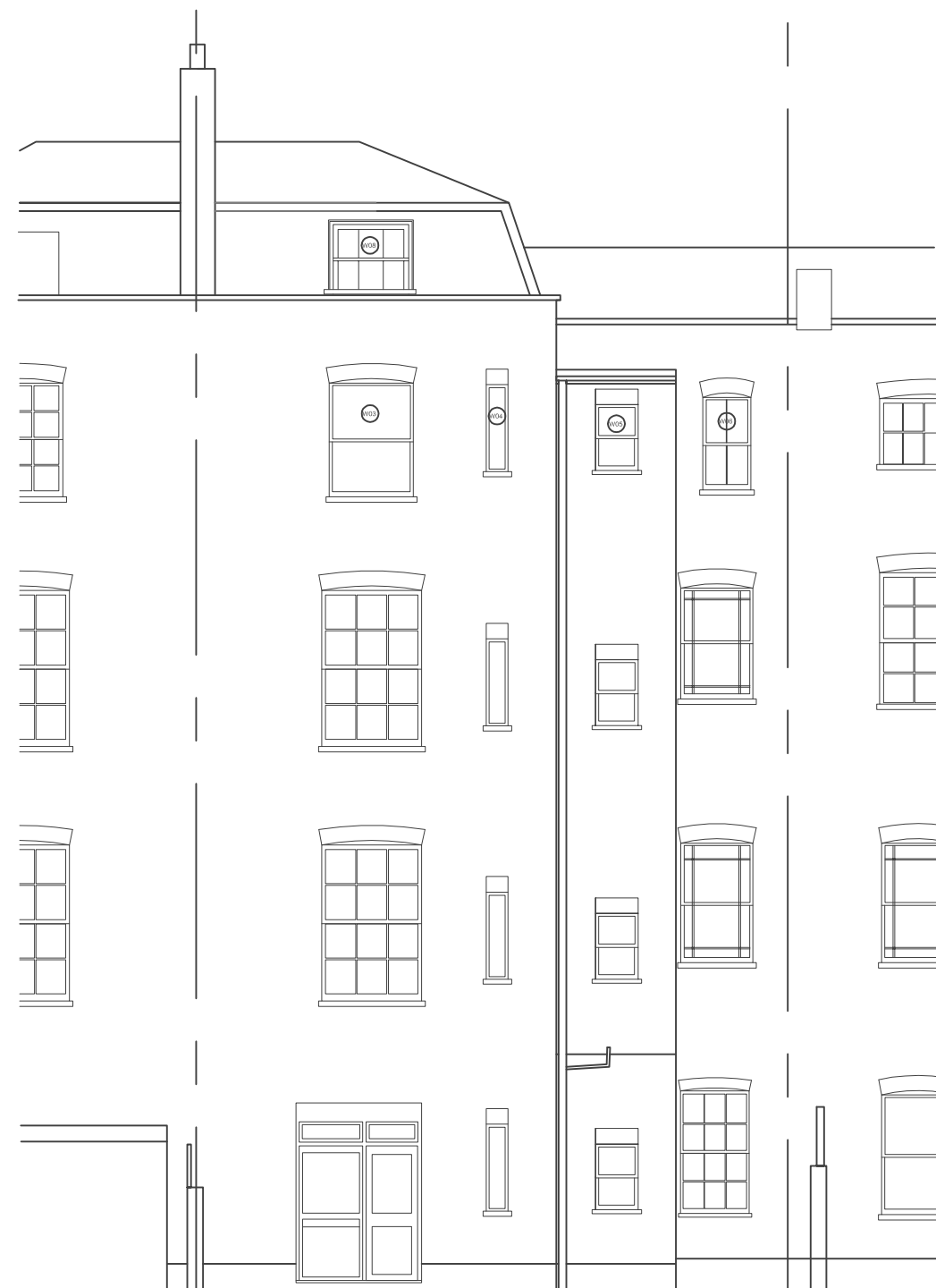
Existing Rear Elevation @ 1:100