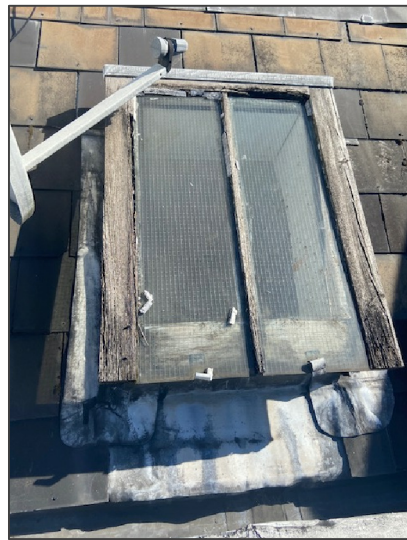
Existing Rooflight RL01

CONSERVATION TYPE ROOF LIGHTS Black low-profile conservation type roof-lights to be double glazed with 16mm argon gap and soft low-E glass. Window Energy Rating to be Band C or better. Roof lights to be fitted in accordance with manufactures instructions with rafters doubled up to sides and suitable flashings etc.