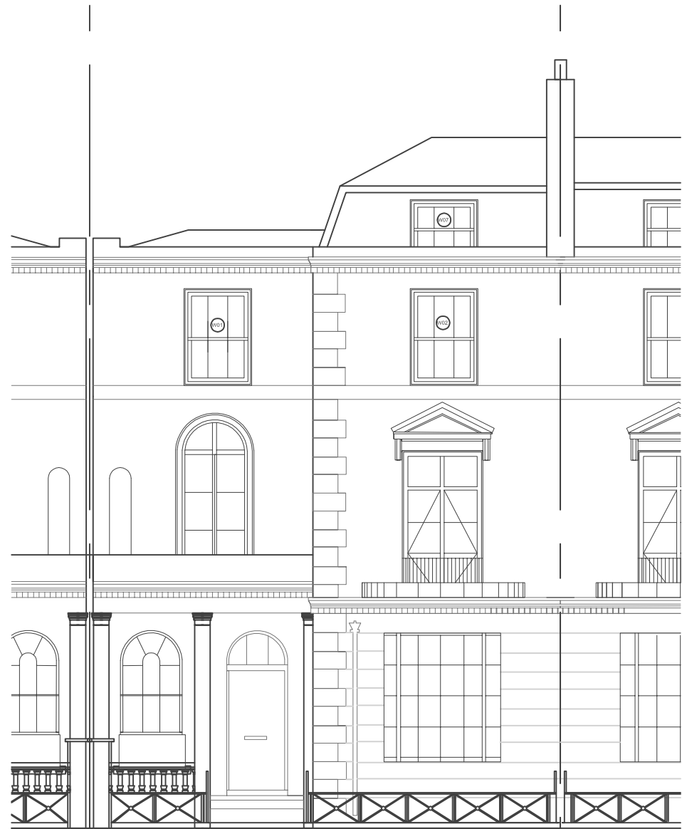
Proposed Front Elevation @ 1:100