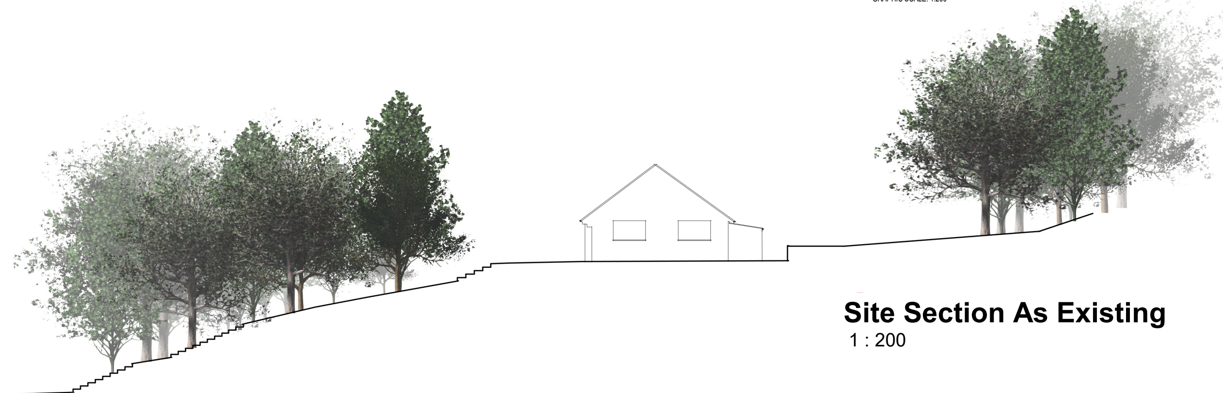
Site Section As Existing 1 : 200

Revisions: A - 18/10/2021 - Updated to Client's comments.