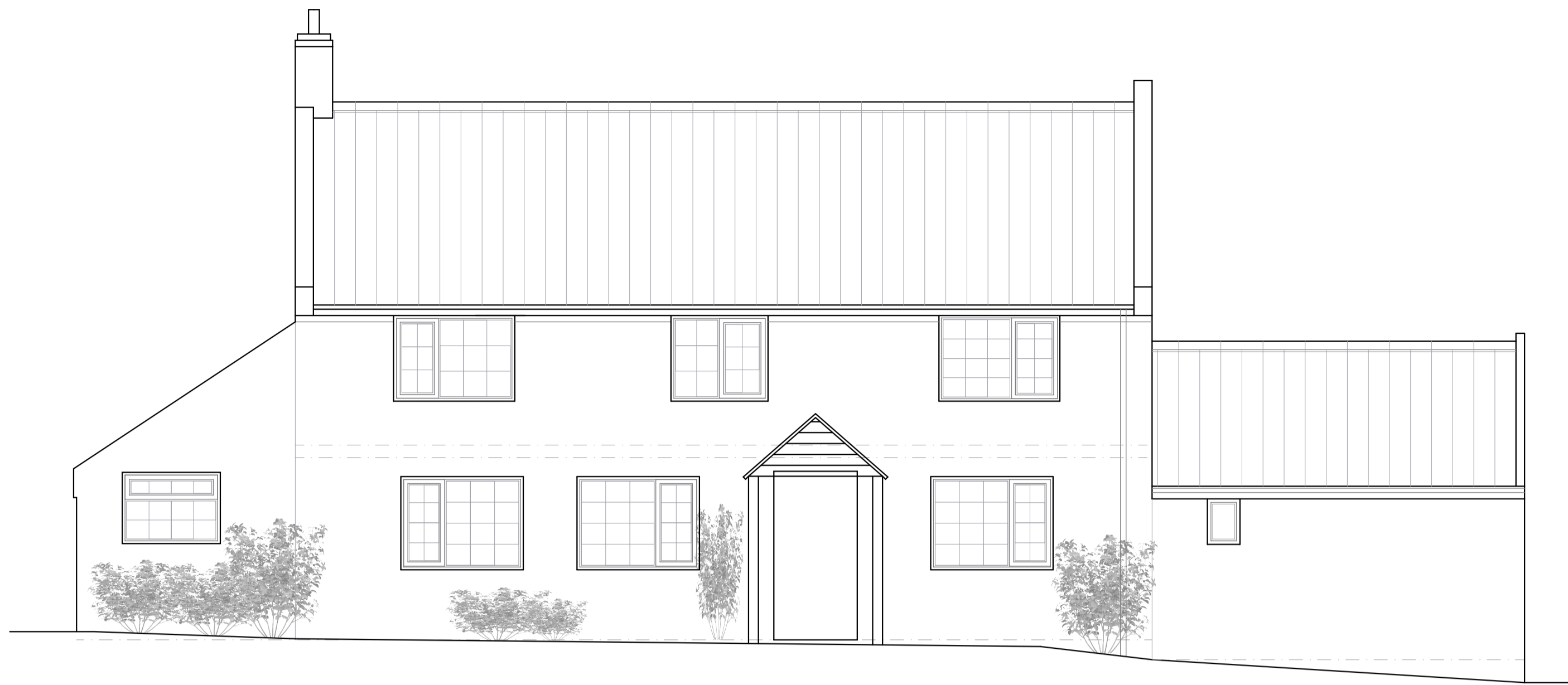
South East Elevation (front) scale - 1:50