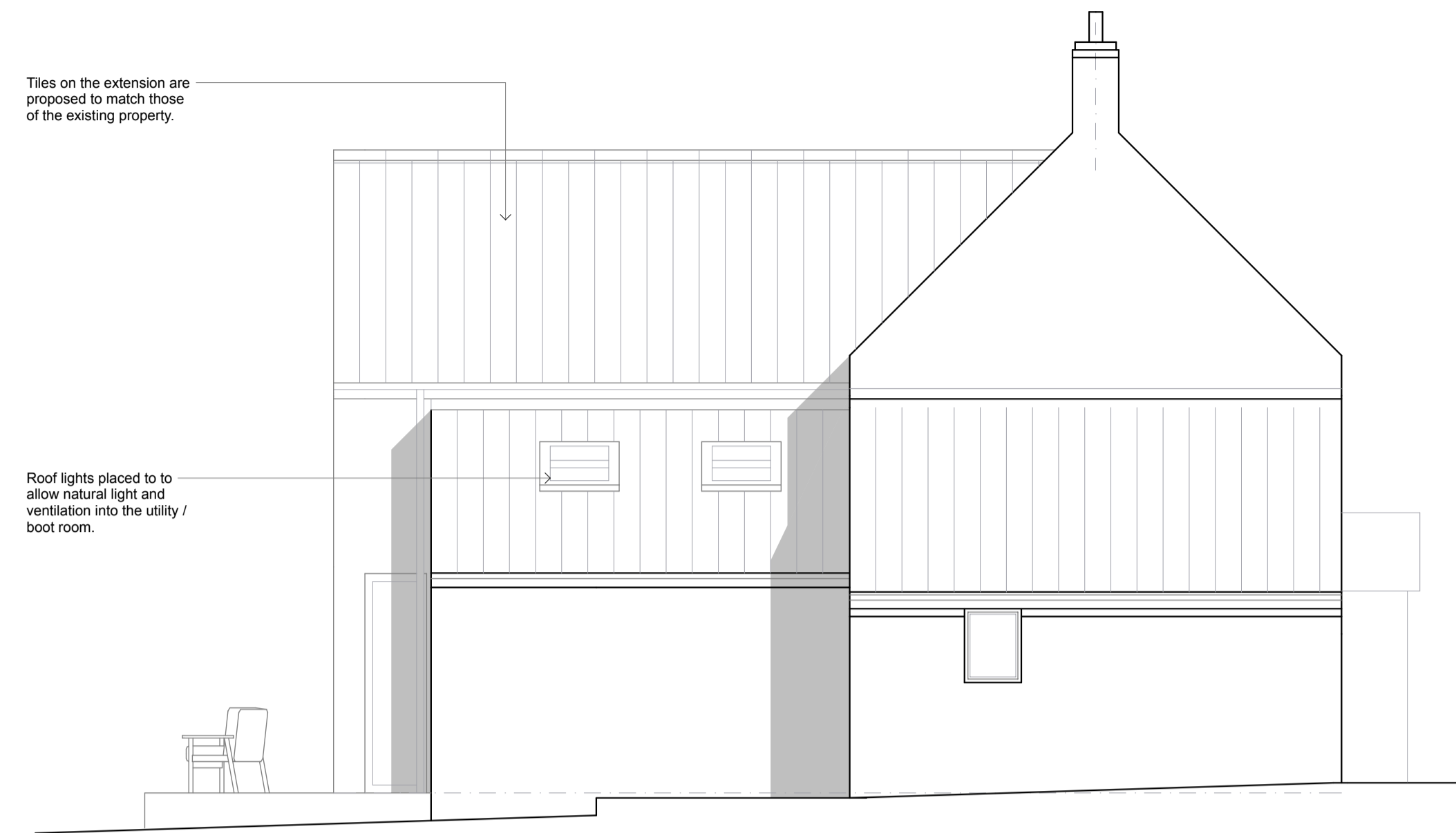
South West Elevation (side) scale - 1:100