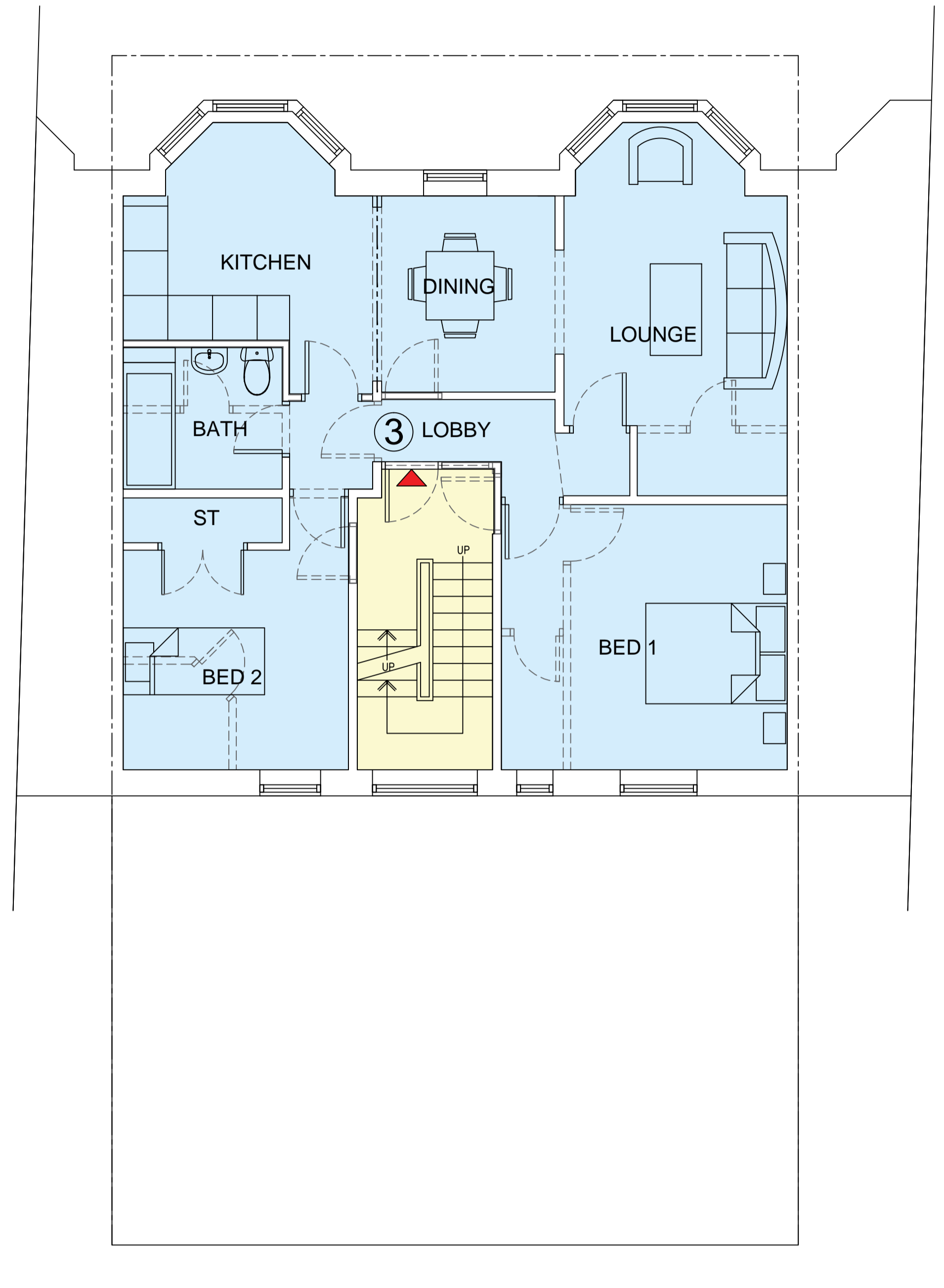
1:50 PROPOSED FIRST FLOOR PLAN