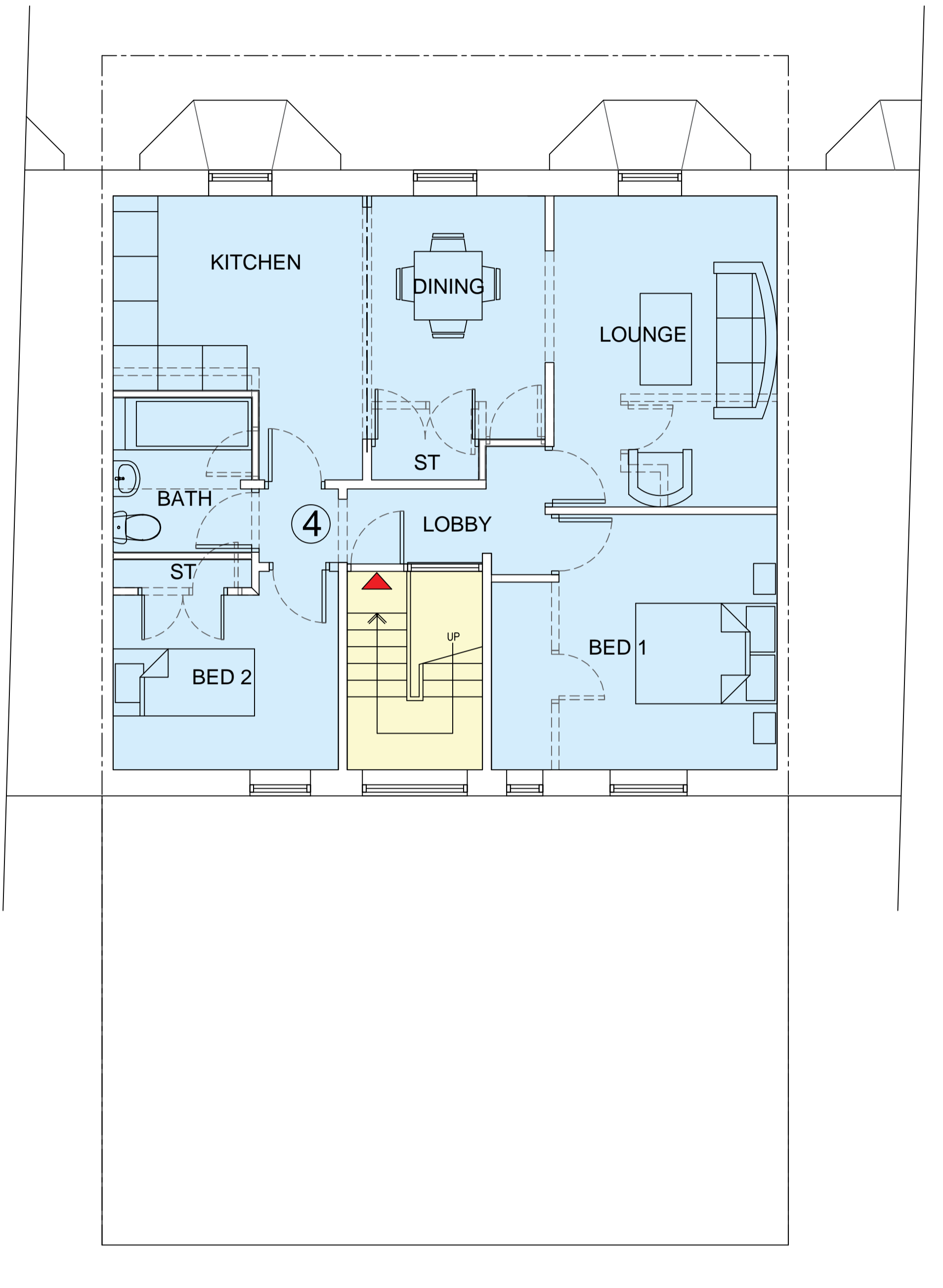
1:50 PROPOSED SECOND FLOOR PLAN