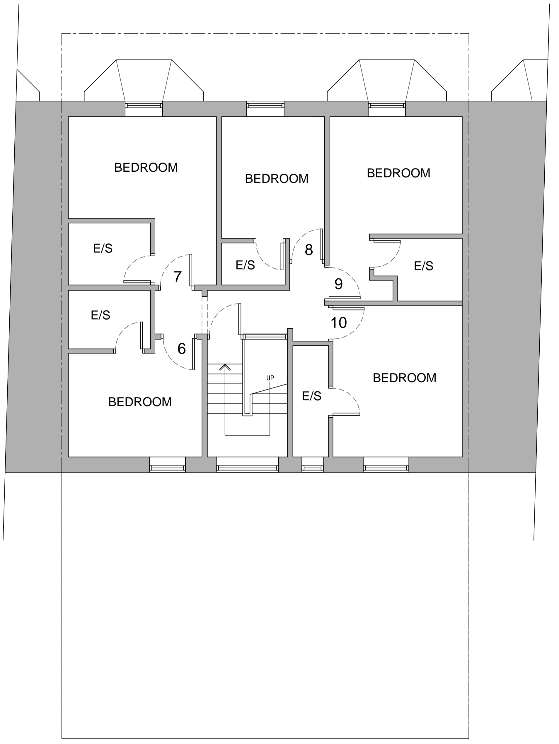
1:50 EXISTING SECOND FLOOR PLAN

THIS DRAWING AND ITS CONTENTS ARE AND REMAIN THE COPYRIGHT OF LINDSAY F ORAM CHARTERED ARCHITECT LIMITED. DO NOT SCALE. IF IN DOUBT SEEK CLARIFICATION.