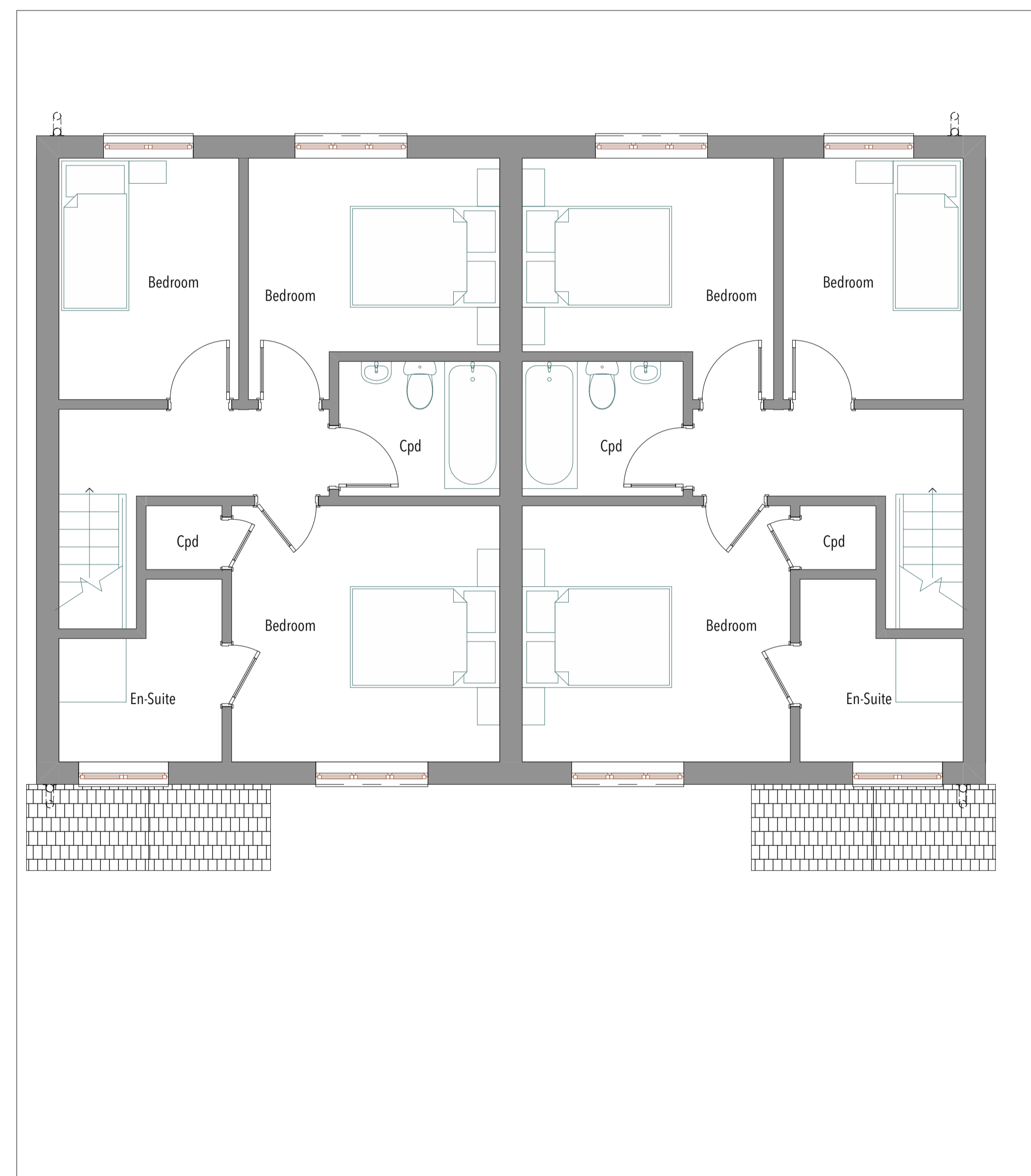
Proposed First Floor Plan 1:50