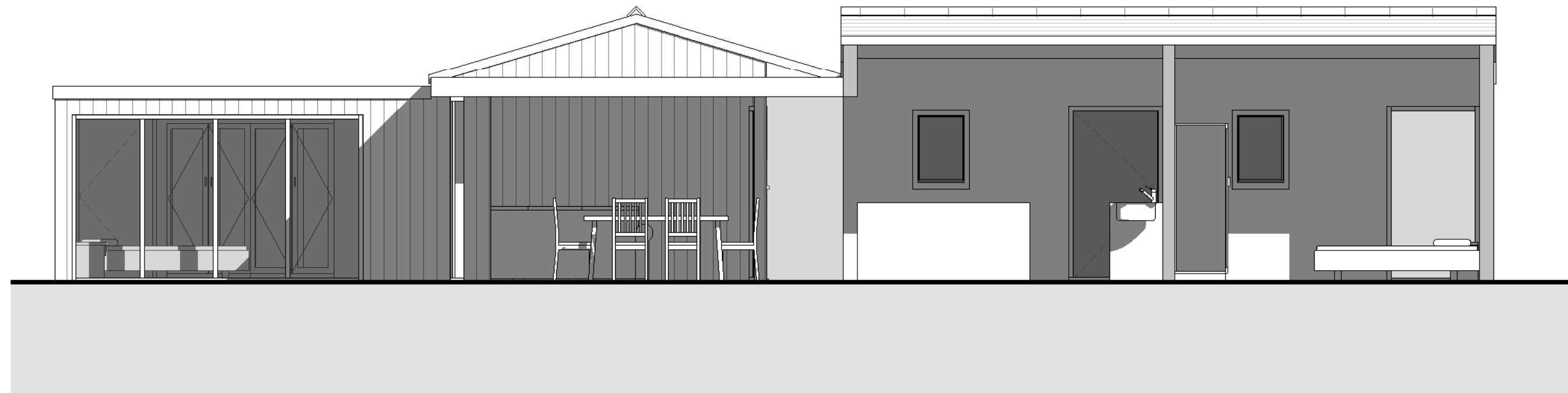
4 Section 1 1 : 50