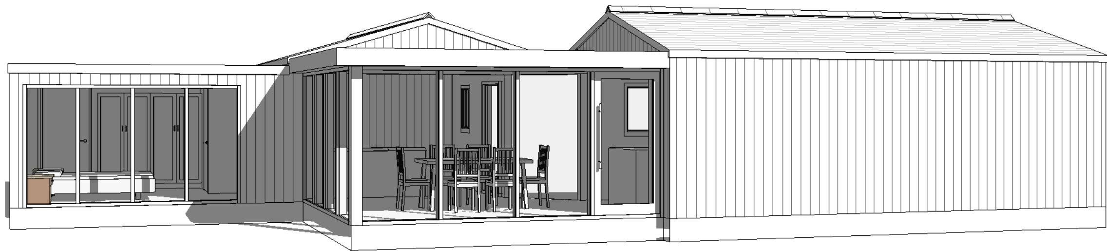
3 3D View 3