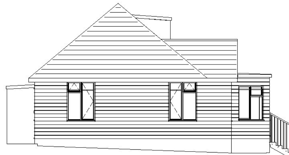
Existing West Elevation