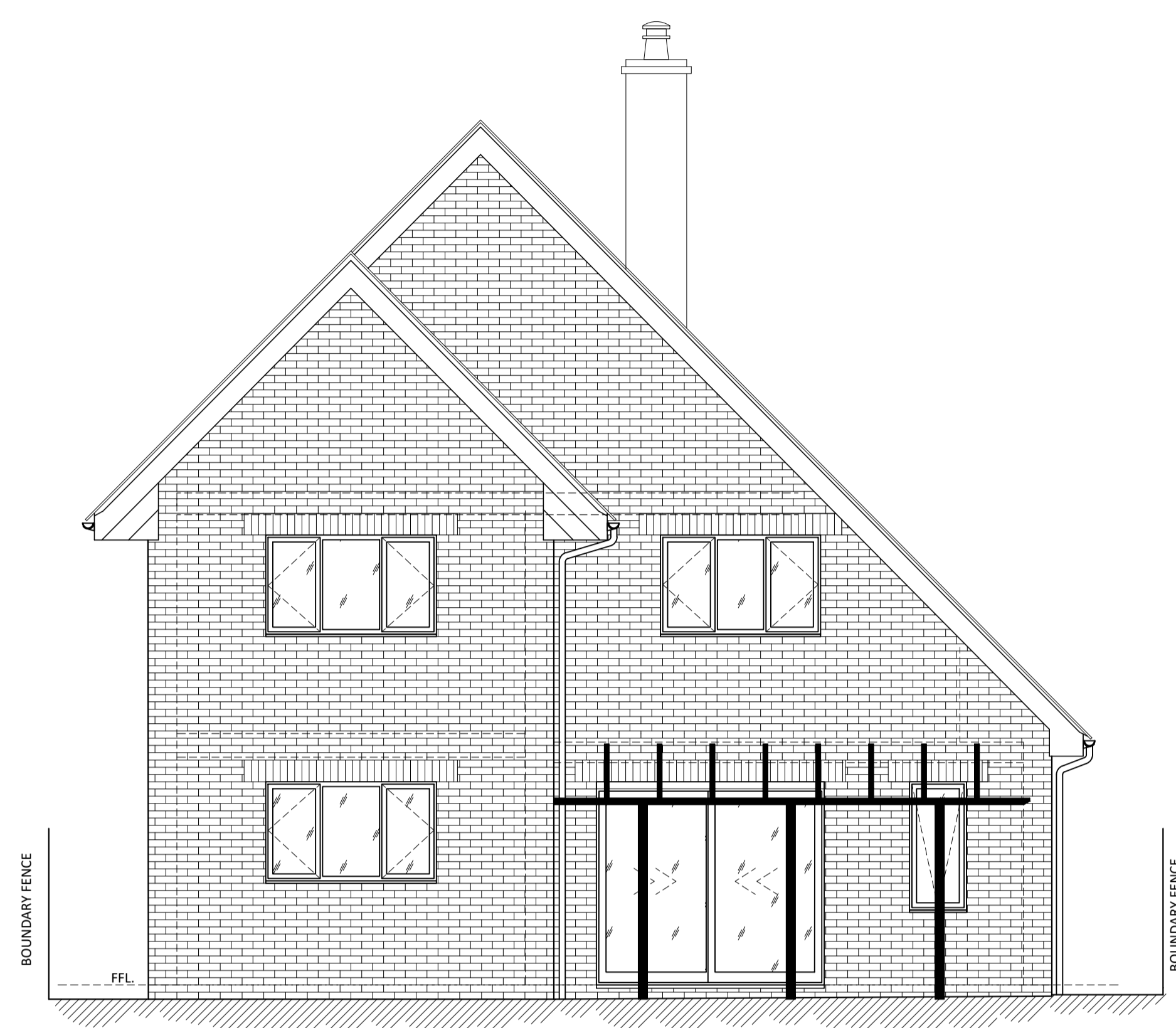
REAR ELEVATION - EXISTING