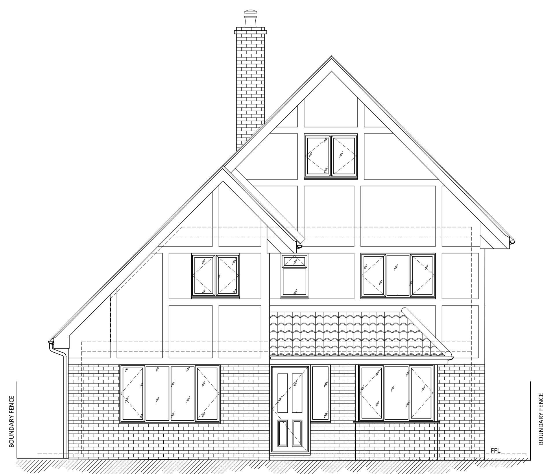
FRONT ELEVATION - EXISTING