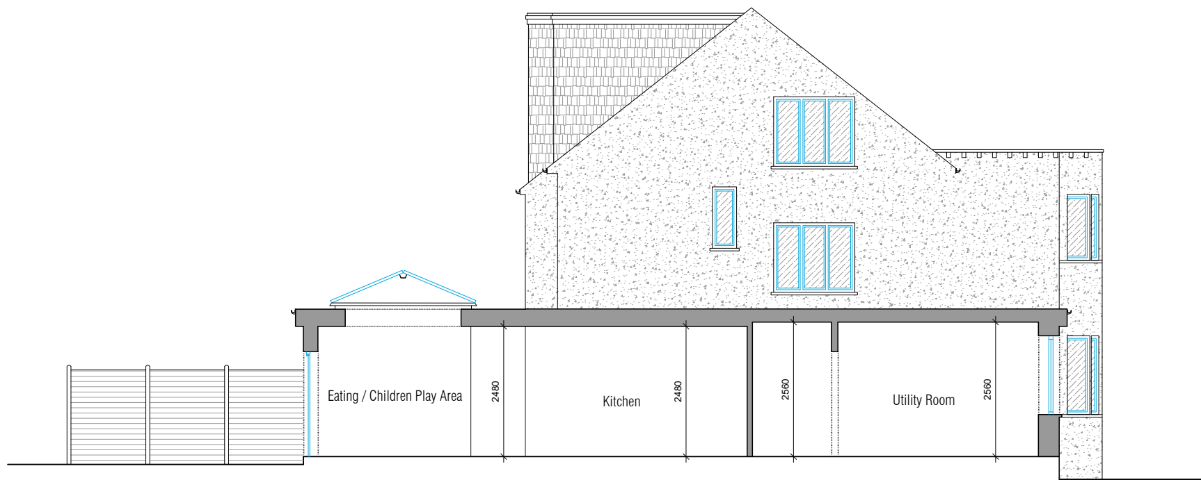
Section B - B