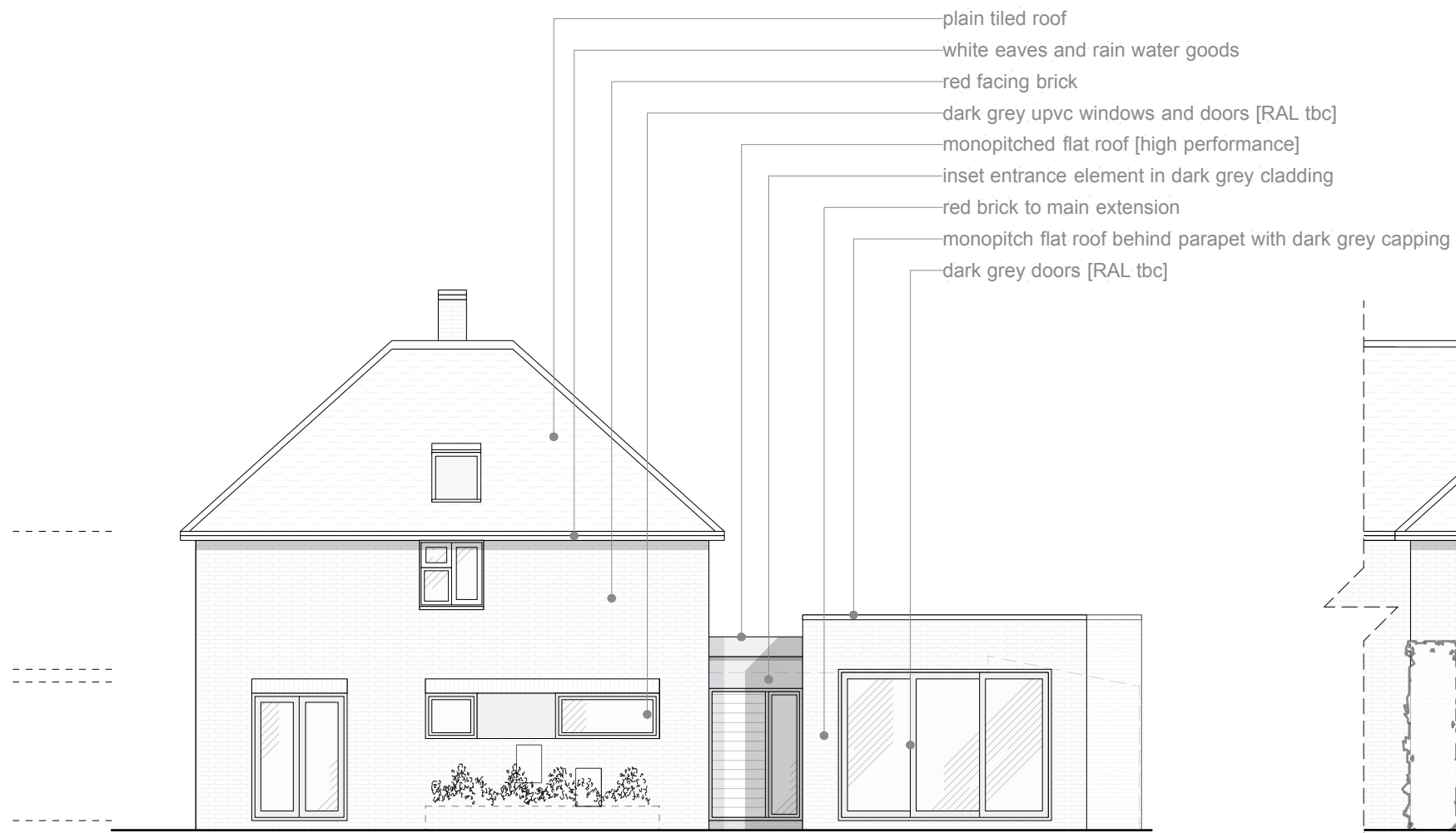
01 proposed west elevation [Crittall Close] Scale: 1:100