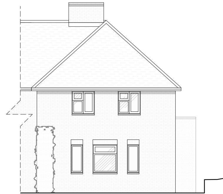
02 proposed north elevation [Set Thorns Road] Scale: 1:100