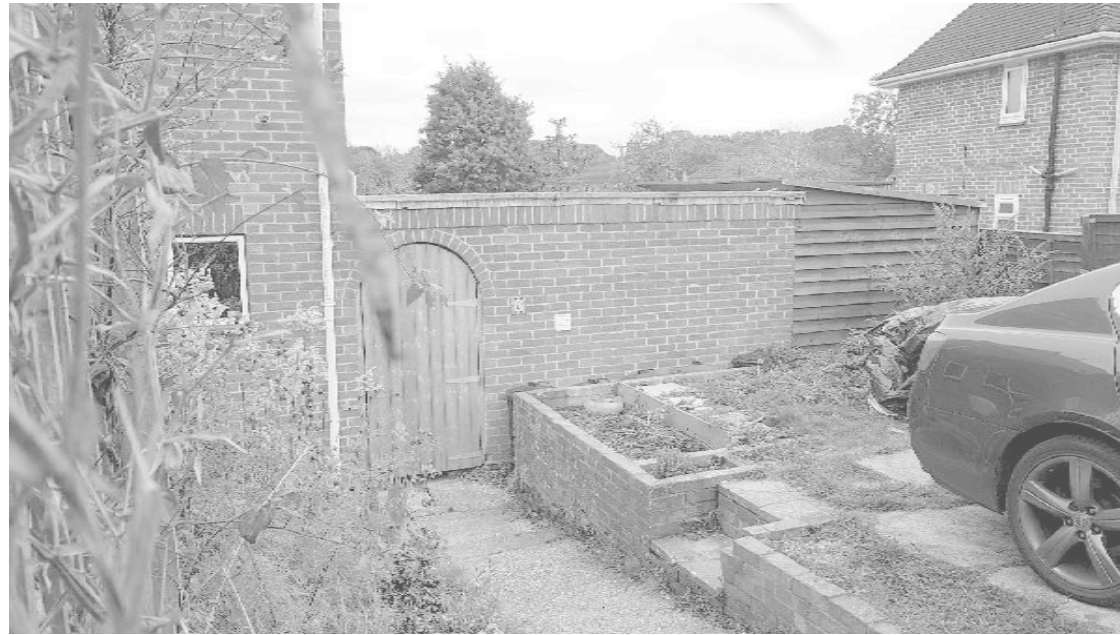
01 existing view