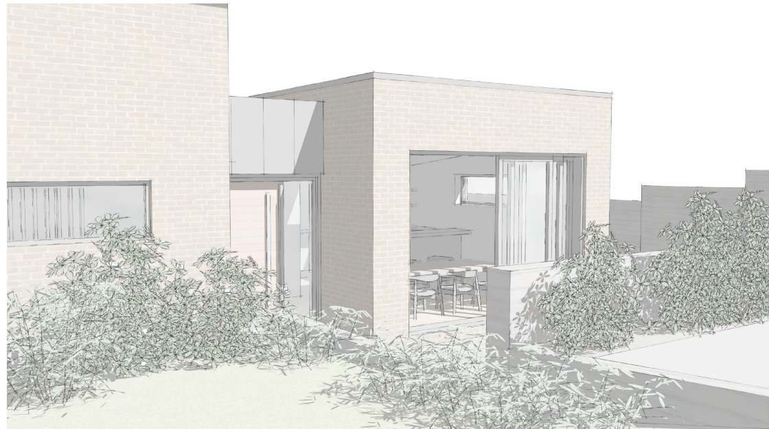
02 proposed view