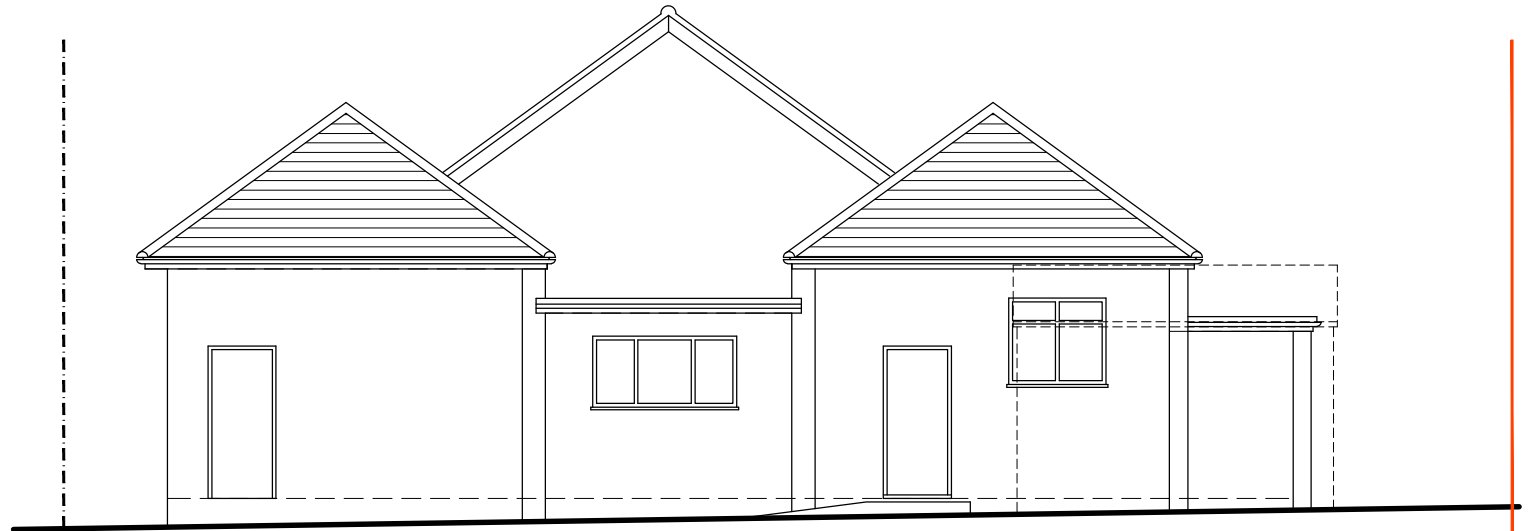
EXISTING EAST ELEVATION Scale 1:100