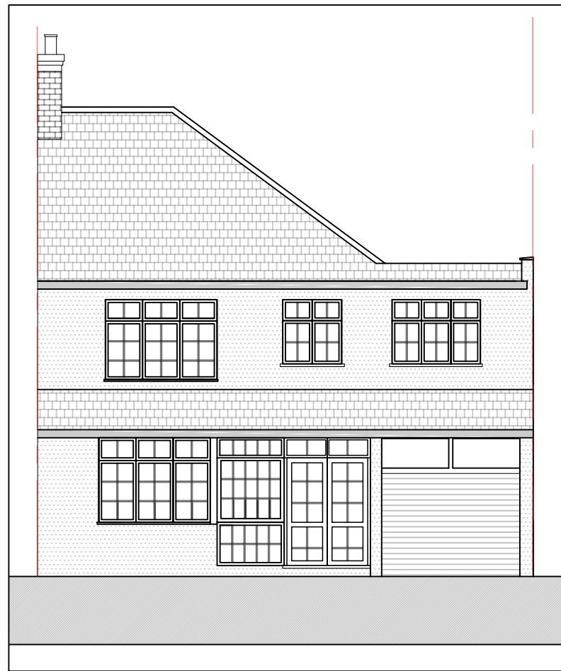
01 | Proposed front elevation Scale - 1:100 @ A3

© This drawing and the building works depicted are the copyright of the easy design & planning company ltd This drawing (or any part of it) may not be reproduced or amended, except without prior written permission by the easy design & planning company ltd This drawing is for planning submission only and should not be used for construction or for the purpose of the sale of the property DO NOT SCALE THIS DRAWING – ALWAYS USE WRITTEN DIMENSIONS – ALL DIMENSIONS TO BE VERIFIED ON SITE