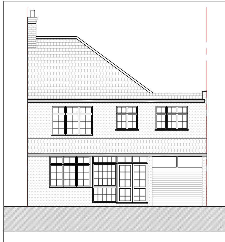
01 Existing front elevation Scale - 1:100 @ A3

DO NOT SCALE THIS DRAWING – ALWAYS USE WRITTEN DIMENSIONS – ALL DIMENSIONS TO BE VERIFIED ON SITE