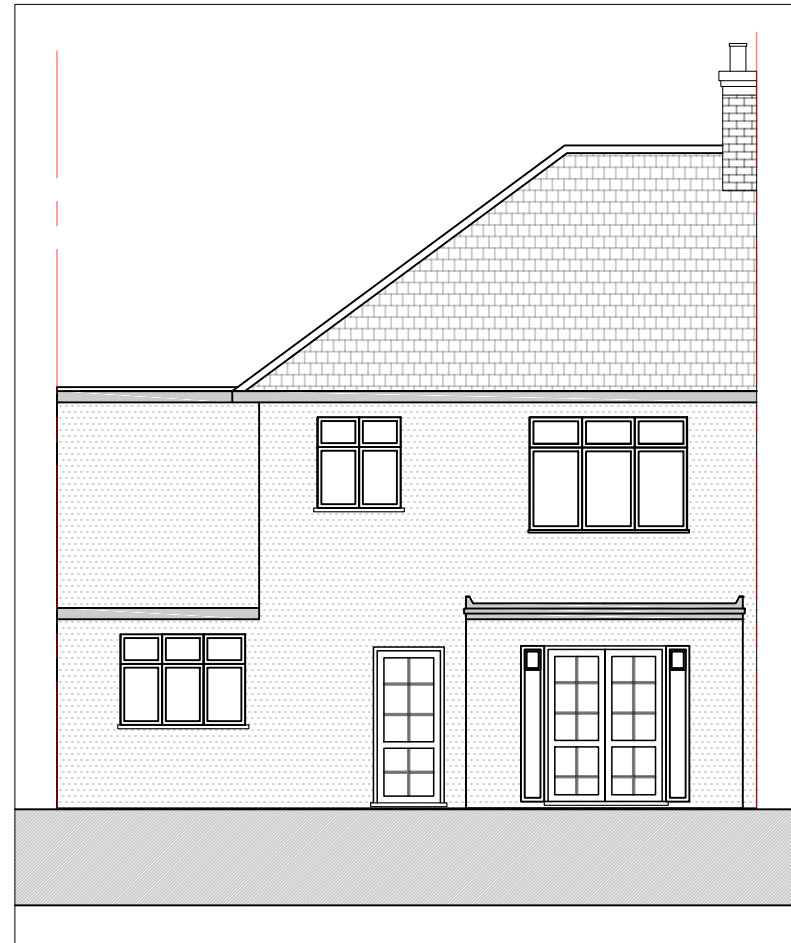
02 Existing rear elevation Scale - 1:100 @ A3