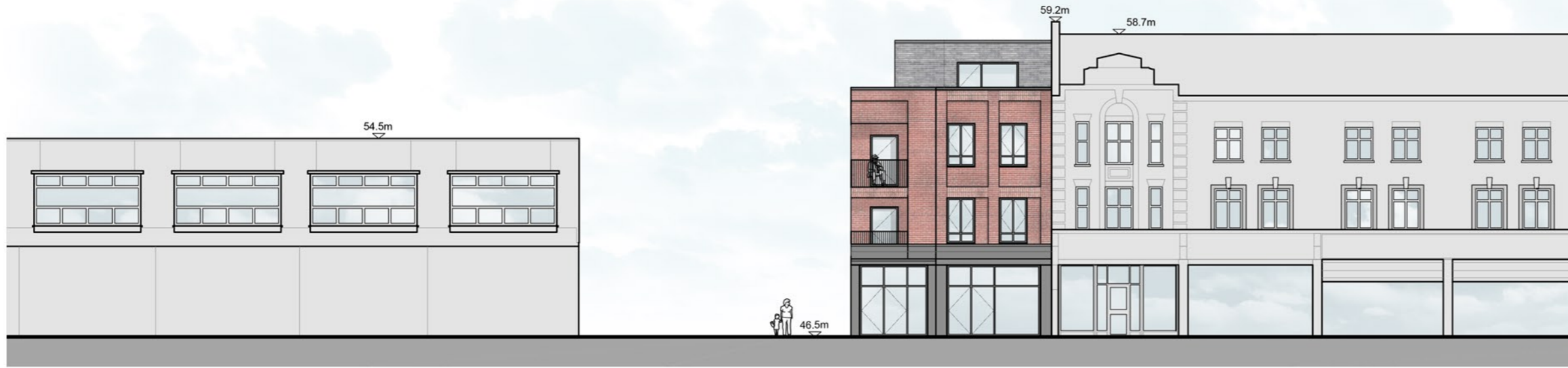
Proposed Bellegrove Road Street Elevation

This drawing and the design are the copyright of ON Architecture Ltd only. This drawing should not be copied or reproduced without written consent. All dimensions are to be checked on site prior to setting out and fabrication and ON Architecture Ltd should be notified of any discrepancy prior to proceeding further. For Construction & Fabrication Purposes - Do not scale from this drawing, use only the illustrated dimensions herein. Additional dimensions are to be requested and checked directly. Illustrated information from 3rd party consultants/specialists is shown as indicatively only. See other consultant / specialist drawings for full information and detail.