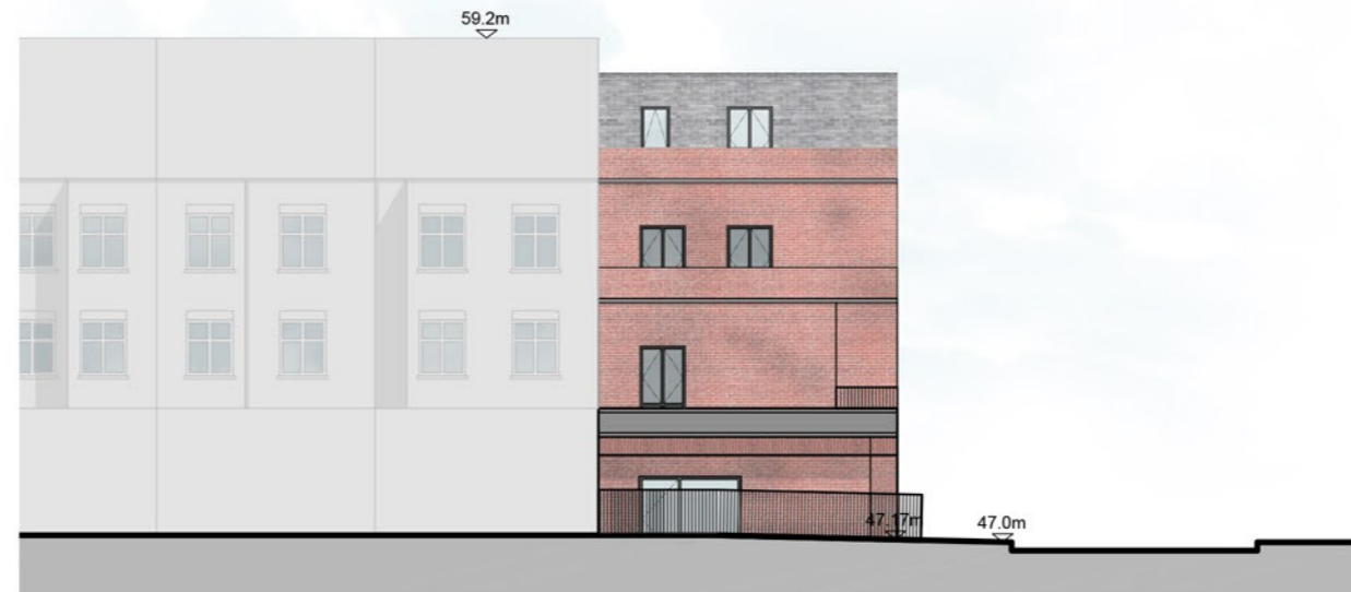
Proposed Rear Elevation (Fronting 2 Deepdene Road)