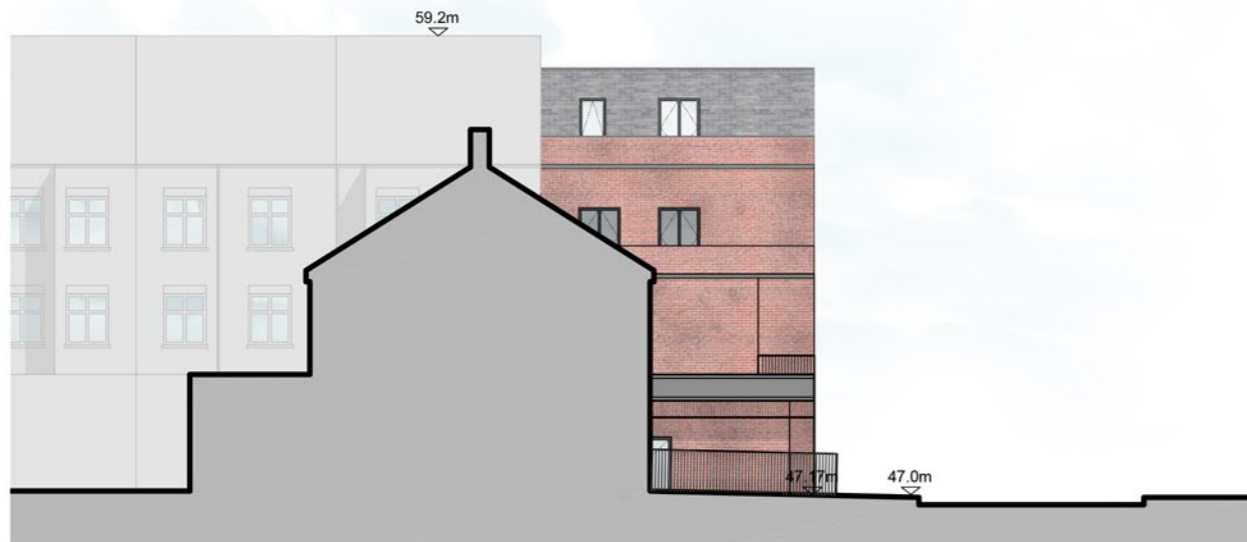
Proposed Rear Elevation (Section Through 2 Deepdene Road)