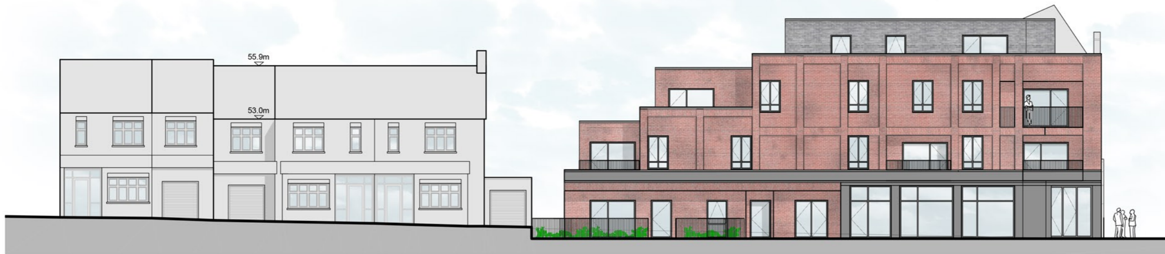
Proposed Deepdene Road Street Elevation