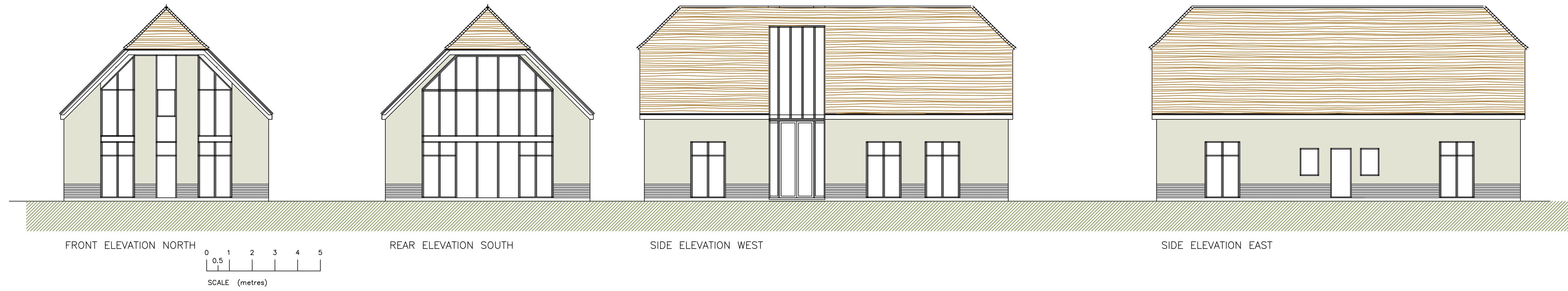
PROPOSED ELEVATIONS 1:100