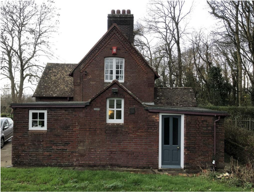
5.04. East elevation 2.