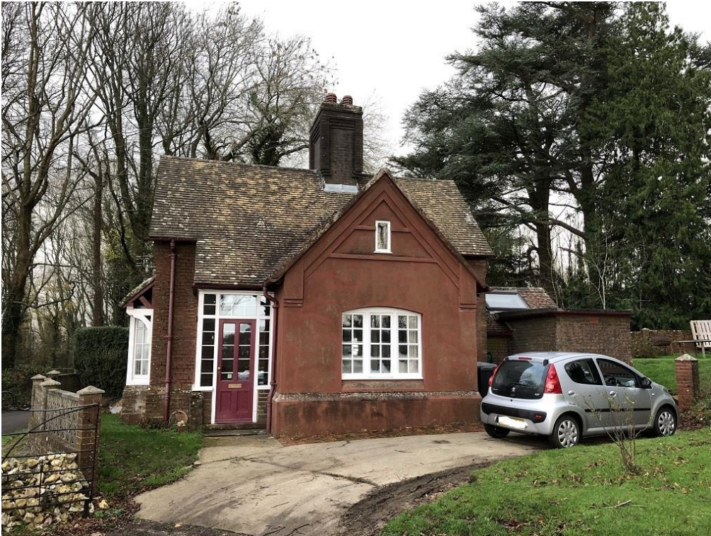
5.01. South elevation 1.