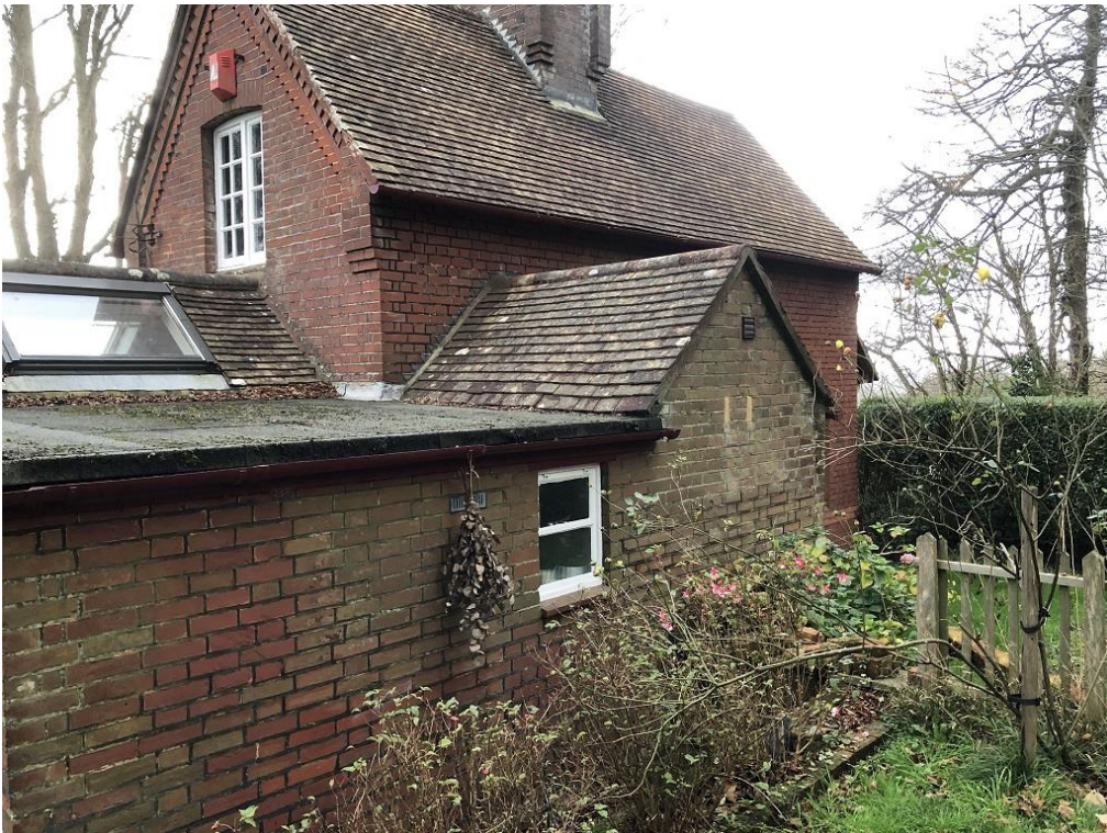
5.07. North elevation 1.