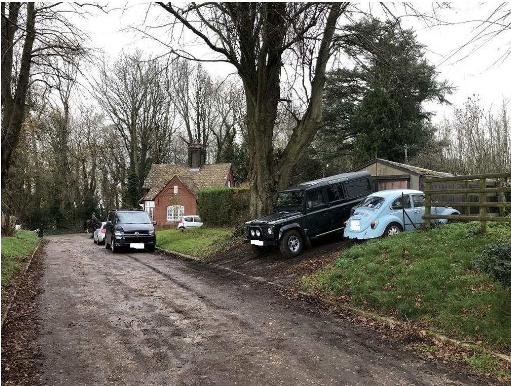
5.13. Looking north from access drive.