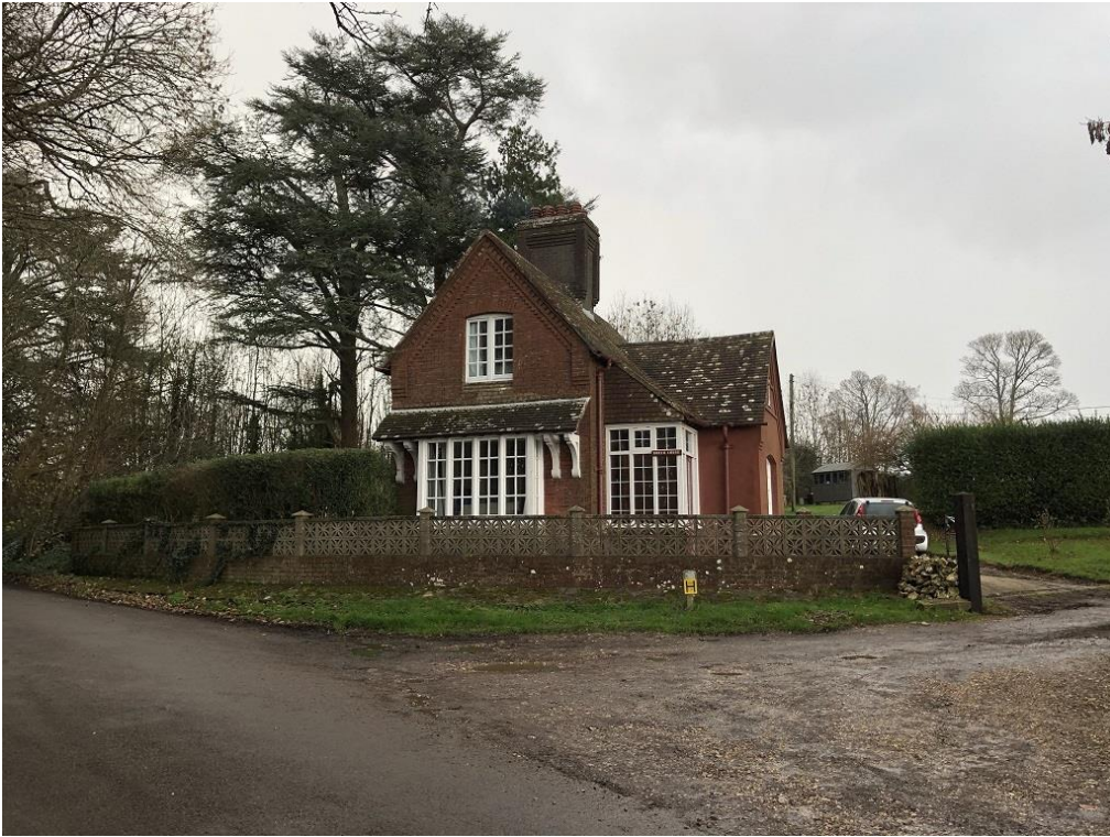
5.10. West elevation 1 looking east from Park Lane.