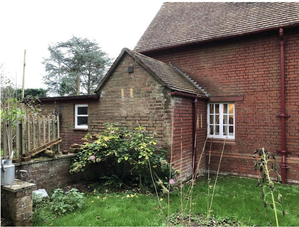
5.08. North elevation 2 looking south.