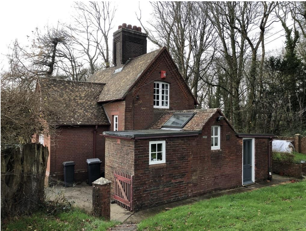
5.03. East elevation 1.