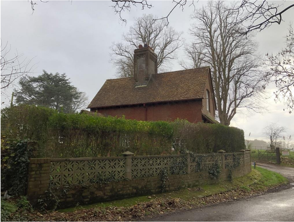
5.12. North elevation looking south from Park Lane.