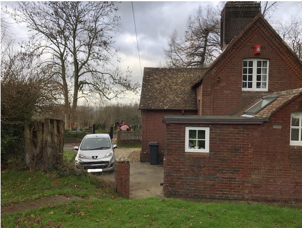
5.05. East elevation 3 looking west from garden.