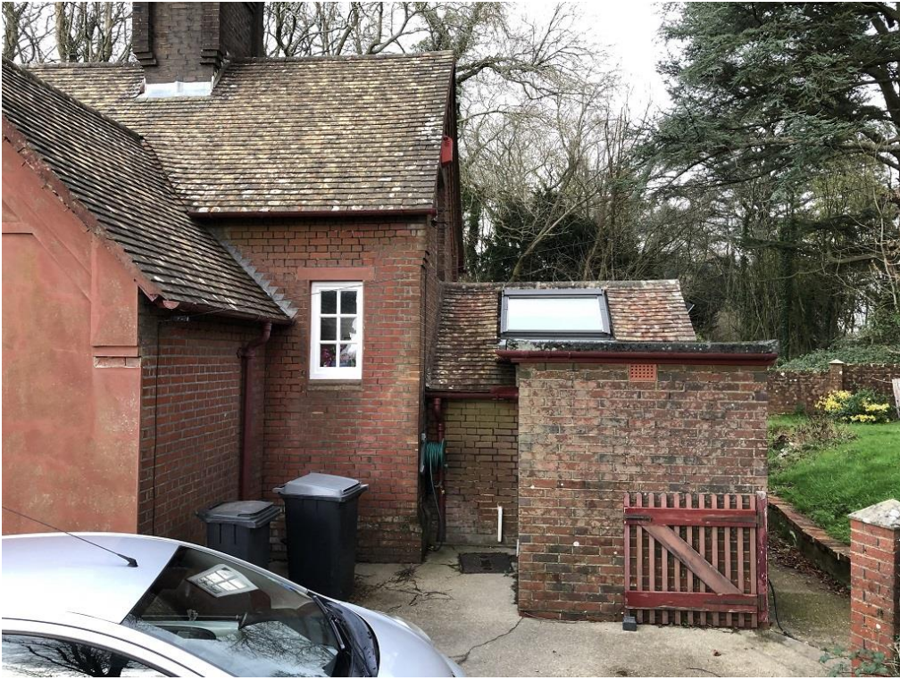
5.02. South elevation 2.