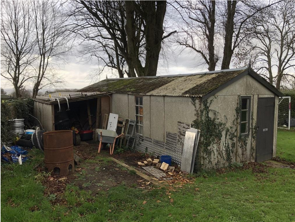
5.14. Garage from garden.