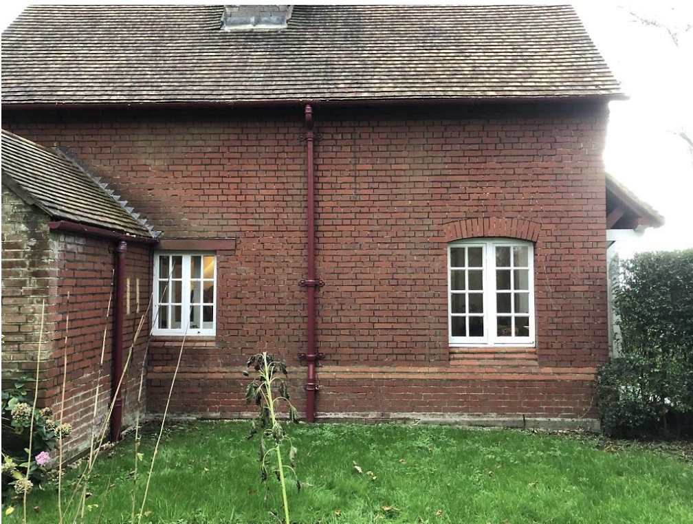
5.09. North elevation 3.