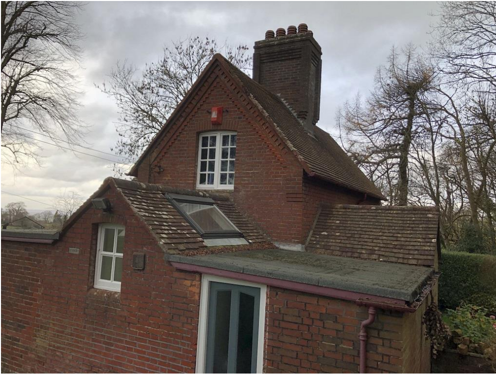
5.06. East elevation 4.