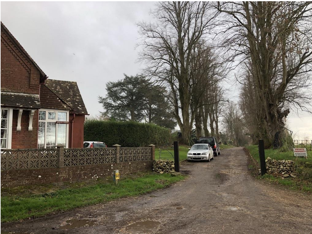
5.11. Looking south from Park Lane towards access drive to Swanmore Park House.