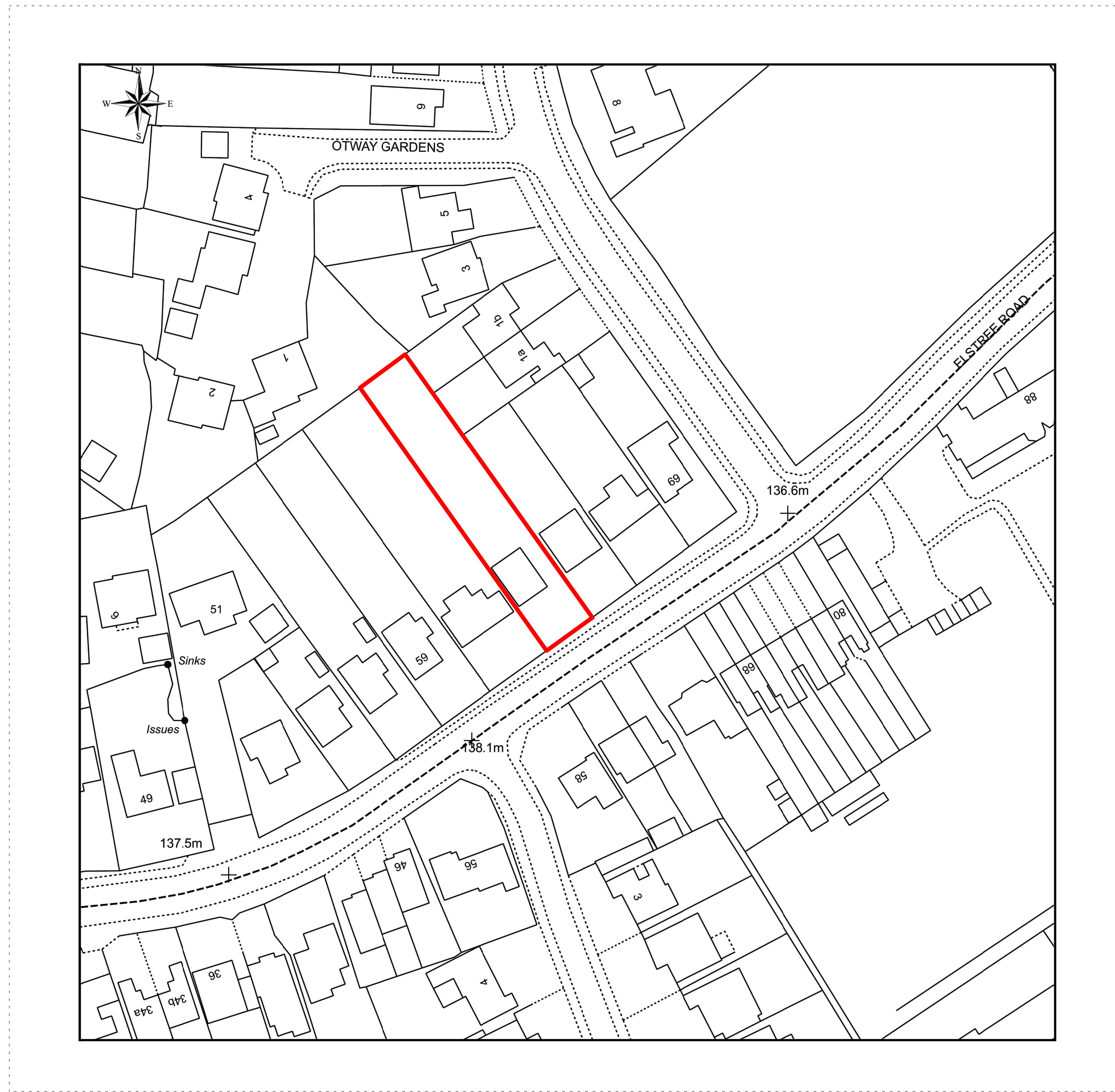
LOCATION PLAN 1:1250@A3

Notes Do not scale from drawing unless for planning purposes. All dimensions to be checked on site. All levels to be checked on site. All setting out must be checked on site. This drawing is copyright WhitemanDesign. This drawing must not be used onsite unless 'Issued for Construction'.