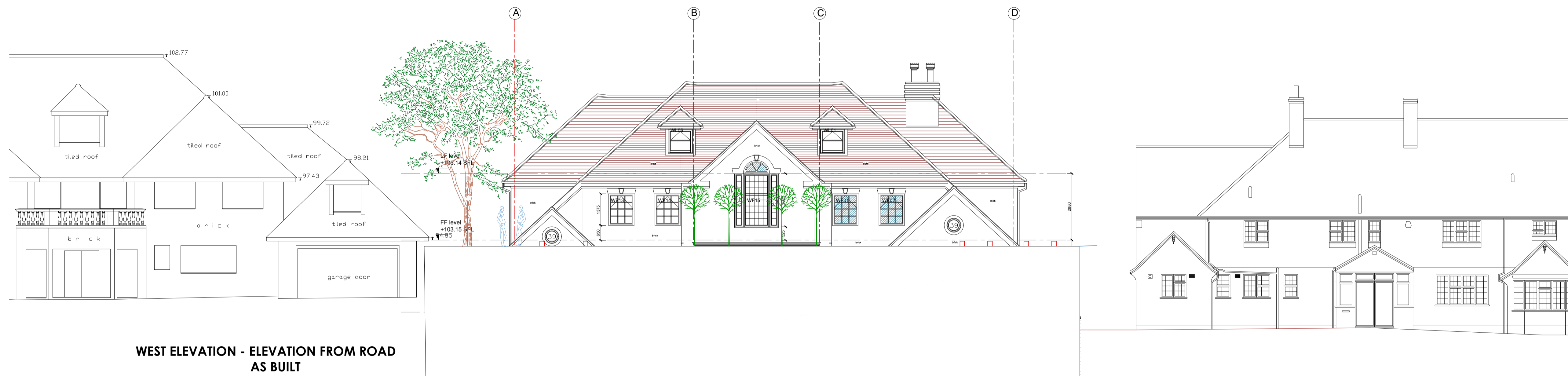
WEST ELEVATION - ELEVATION FROM ROAD AS BUILT