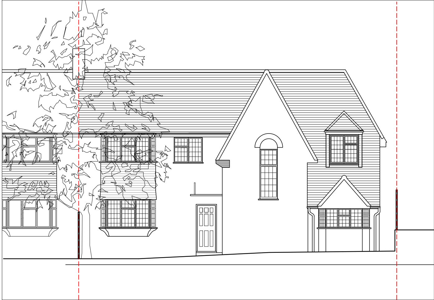
F R O N T