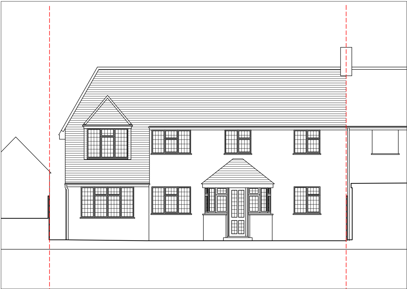
R E A R