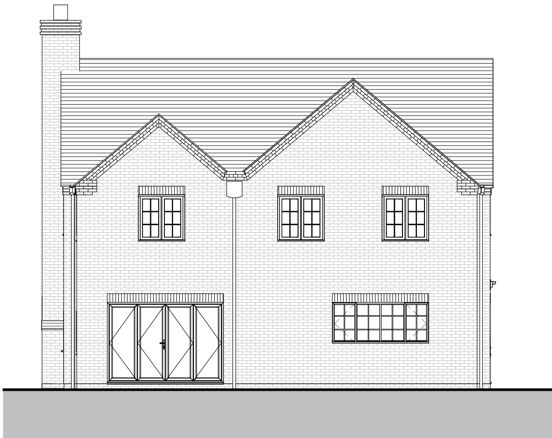
Rear Elevation 1 : 100