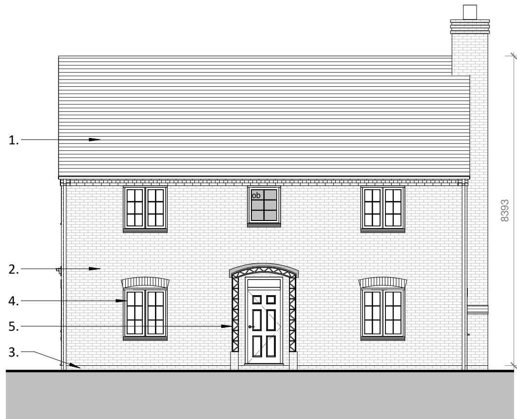
Front Elevation 1 : 100