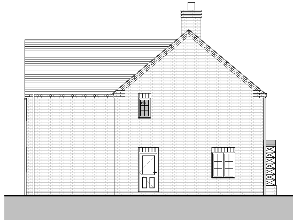
Side Elevation 1 1 : 100