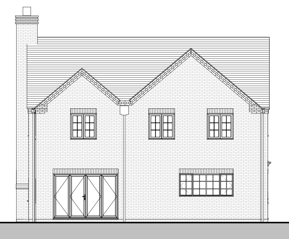
Rear Elevation 1:100

Side Elevation 1 1: 100 Om 2m 4m 6m 8m 10m VISUAL SCALE 1:100 @ A3