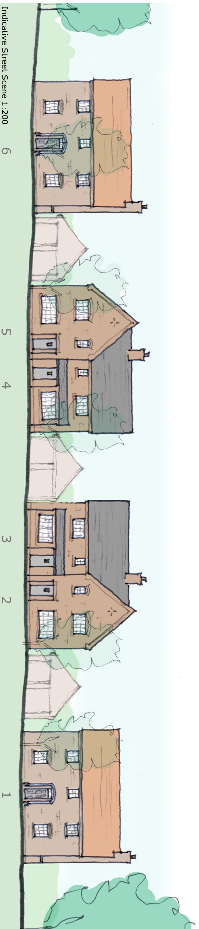
Indicative Street Scene 1:200