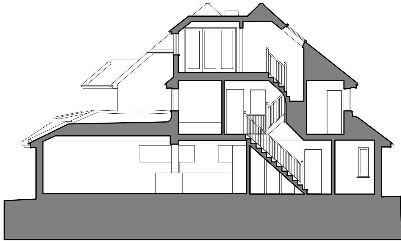
01 Existing Section P(03)_100 1:100@A3