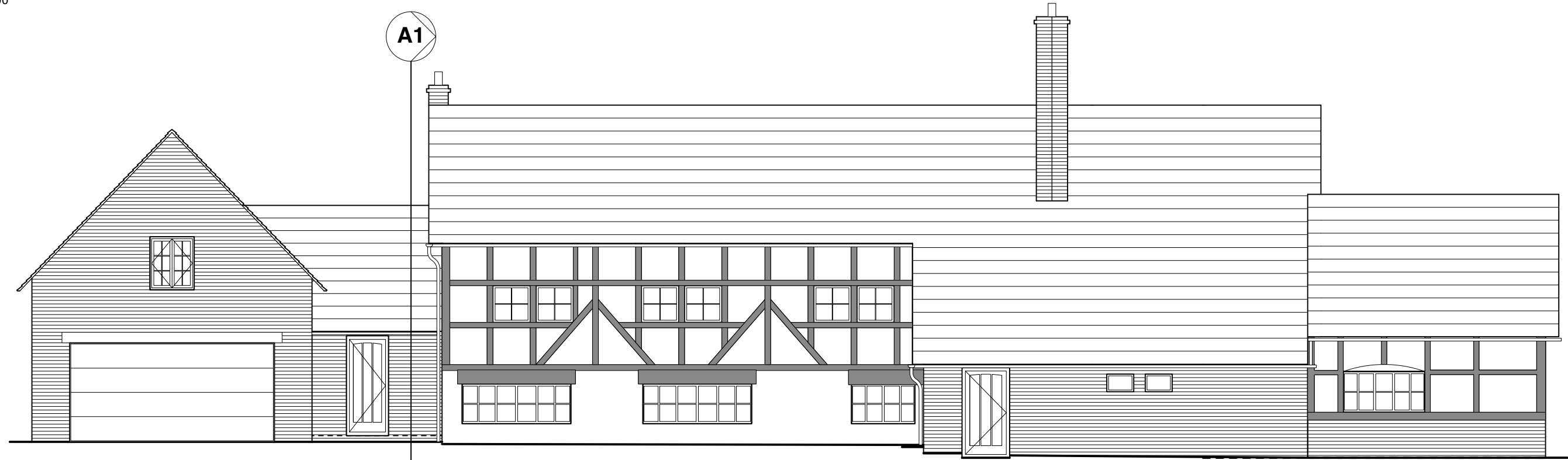
1 NORTH ELEVATION SCALE - 1:100