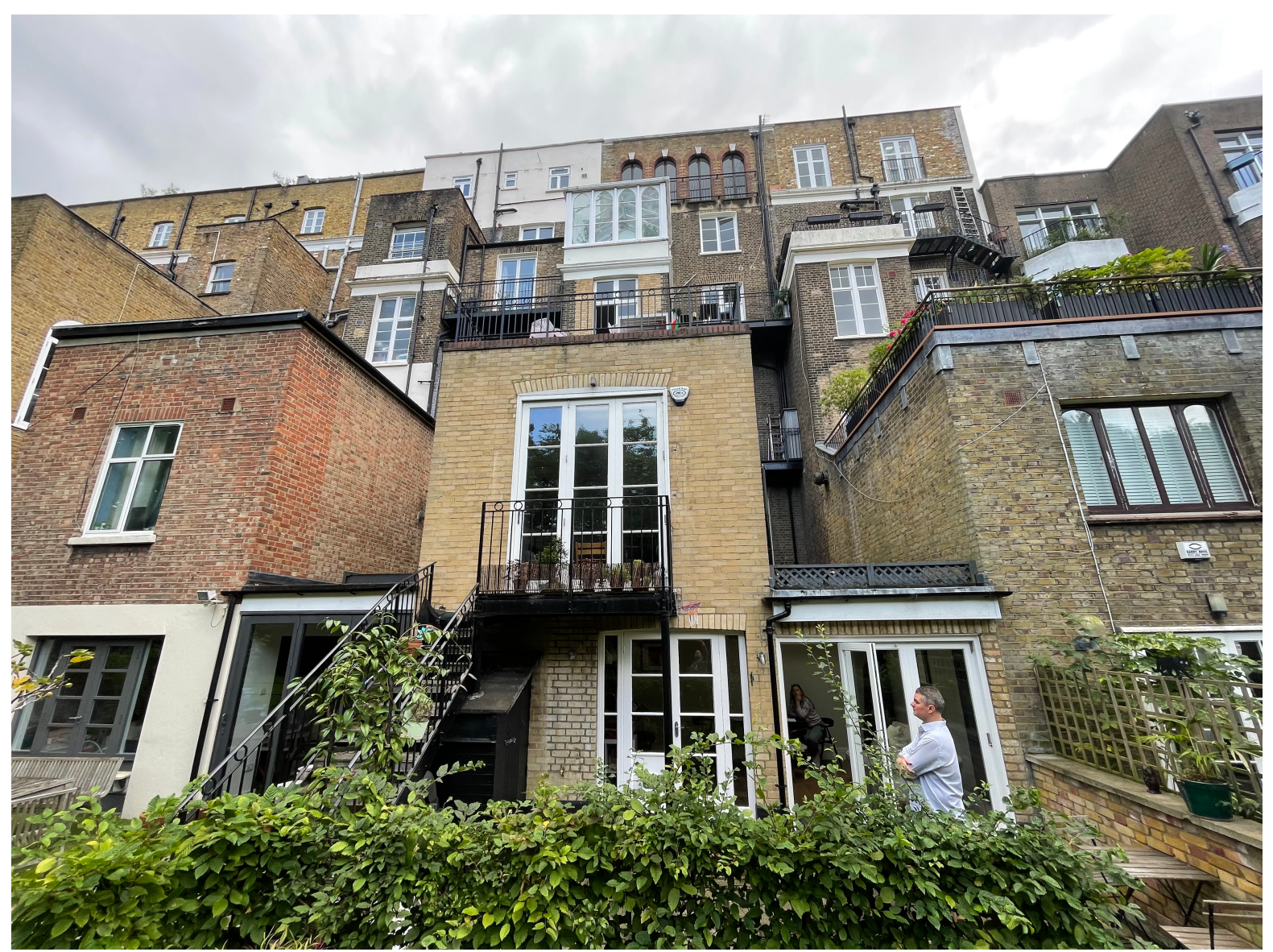
Photograph of rear of 178a Sutherland Avenue

The storage of waste and recyclable material will be accommodated at the front of the property within the required access of the waste management collection service. Additional containers within each of the new properties shall be installed to increase the amount of recyclable waste and encourage the use of this service.