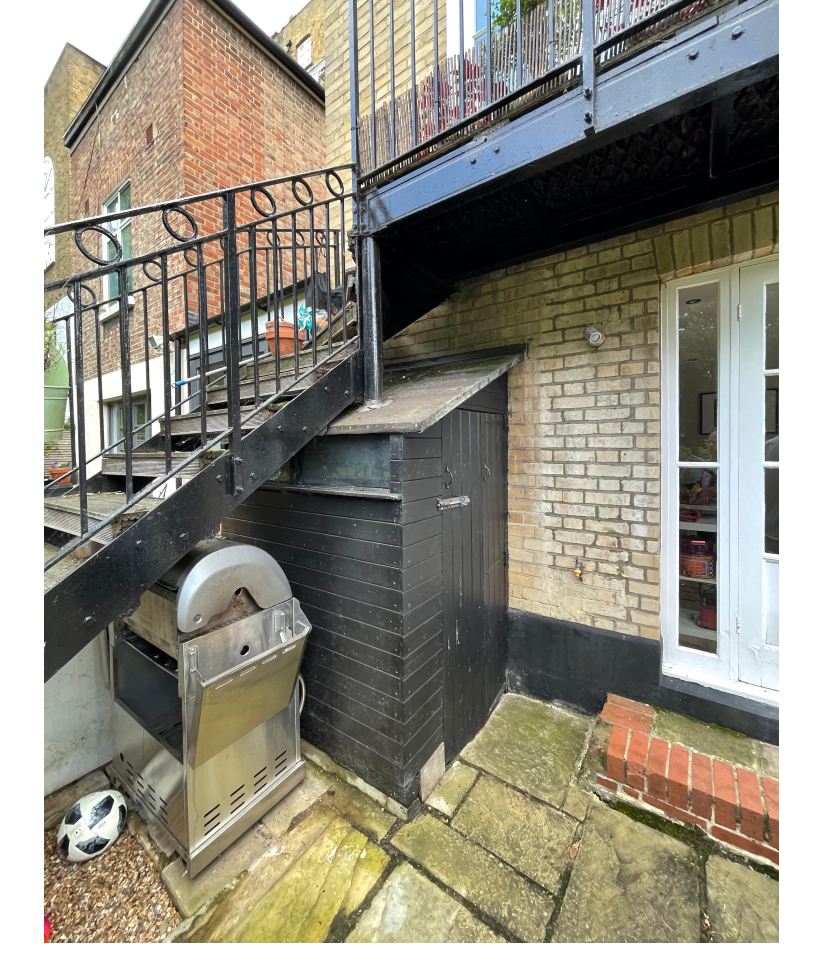
Photographs of rear of 178a Sutherland Avenue