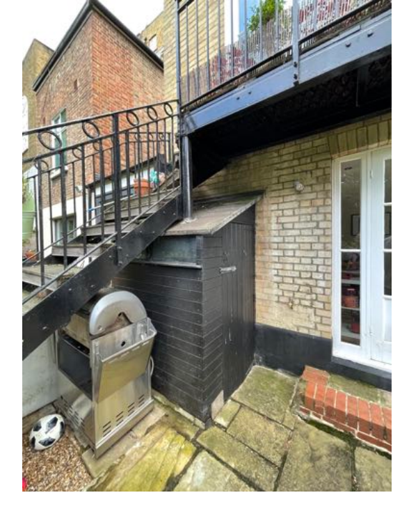
Photographs of rear of 178a Sutherland Avenue