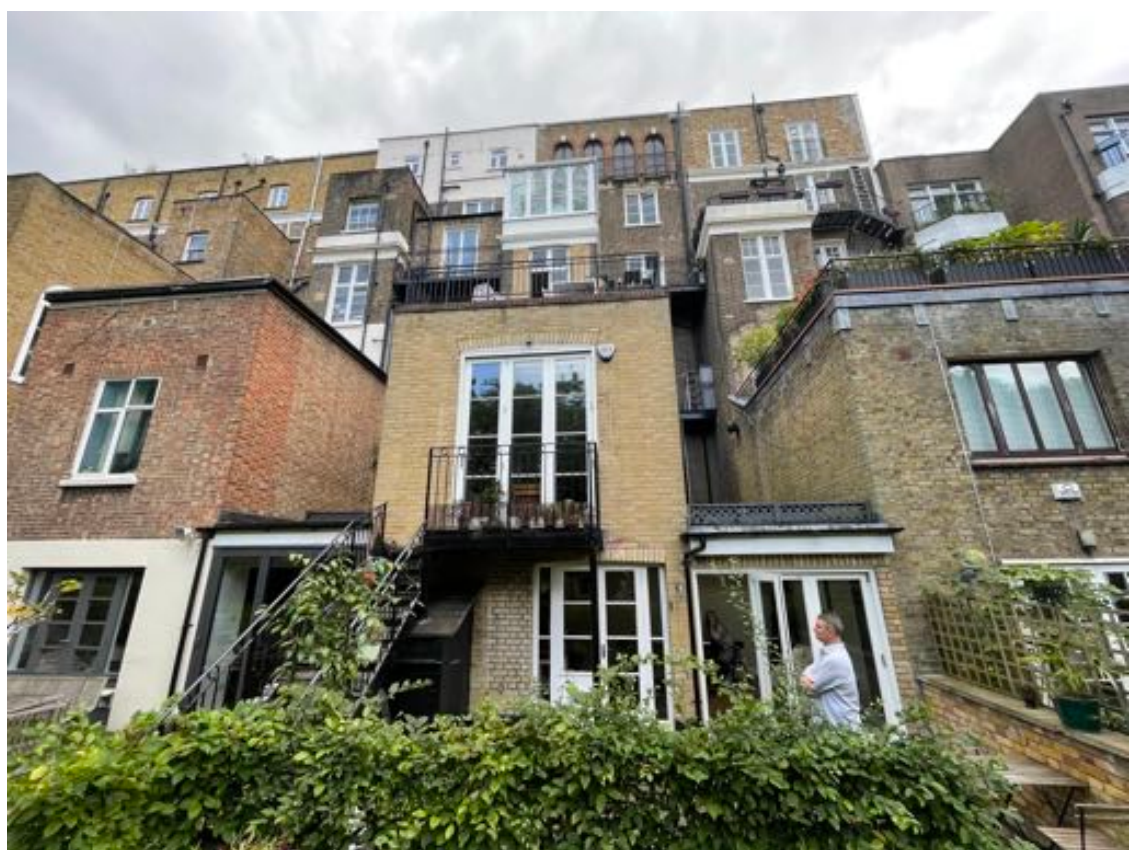
Photograph of rear of 178a Sutherland Avenue

The storage of waste and recyclable material will be accommodated at the front of the property within the required access of the waste management collection service. Additional containers within each of the new properties shall be installed to increase the amount of recyclable waste and encourage the use of this service.