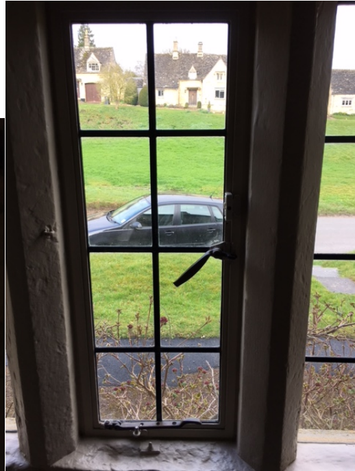
Photos 4 & 5: showing one of the mullion window casements from inside and the centre casement opens