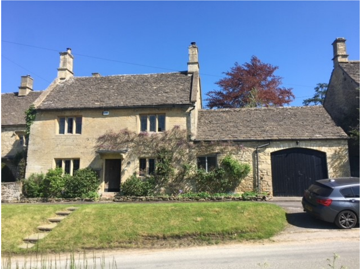
Photo 1: front of property. Secondary glazing to be added to the 4 sets of mullion windows to the LHS and RHS of the front door on both the ground and first floor. Additional secondary glazing to be added to the ground floor window to the LHS of the garage.