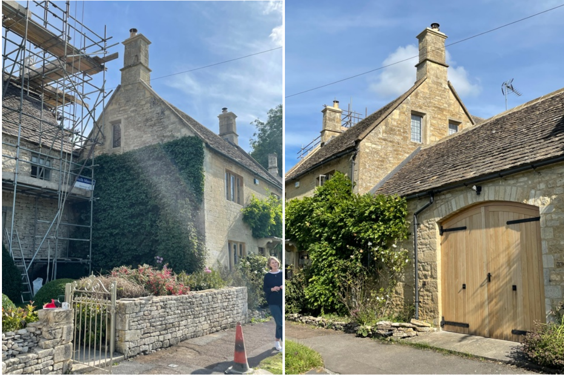
Photos 2 & 3: showing the second floor windows on the side of the property (1 on the LHS, 2 on the RHS) where secondary glazing will be added