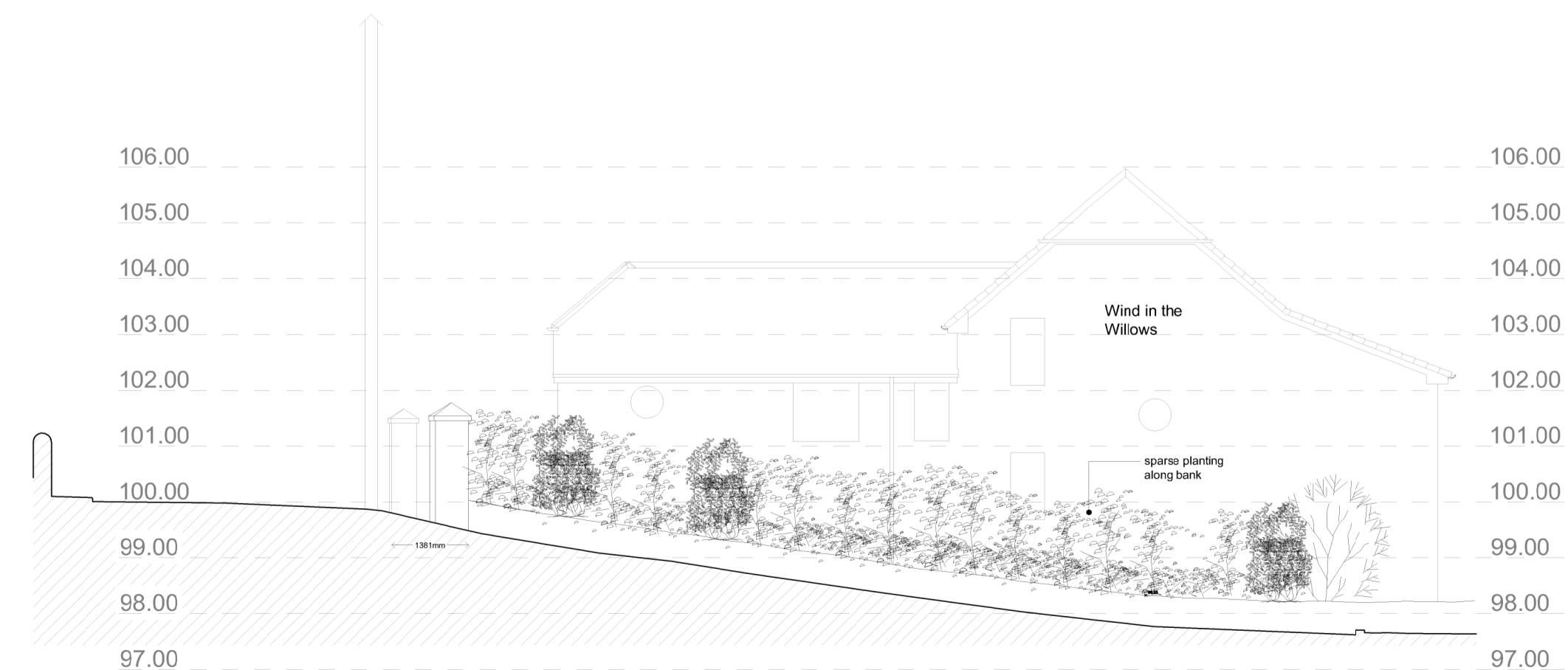
Section B - B / Northwest Elevation