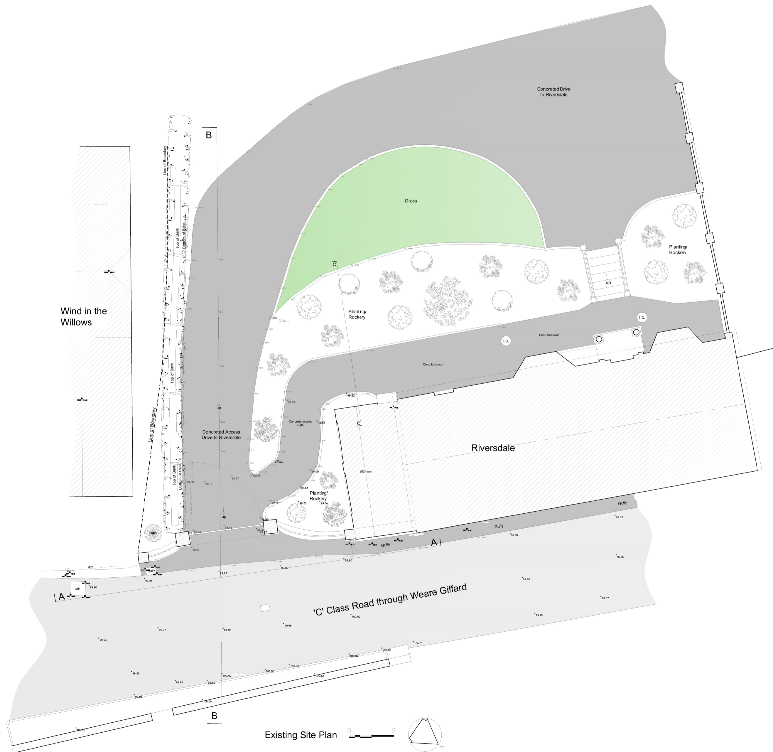
Existing Site Plan