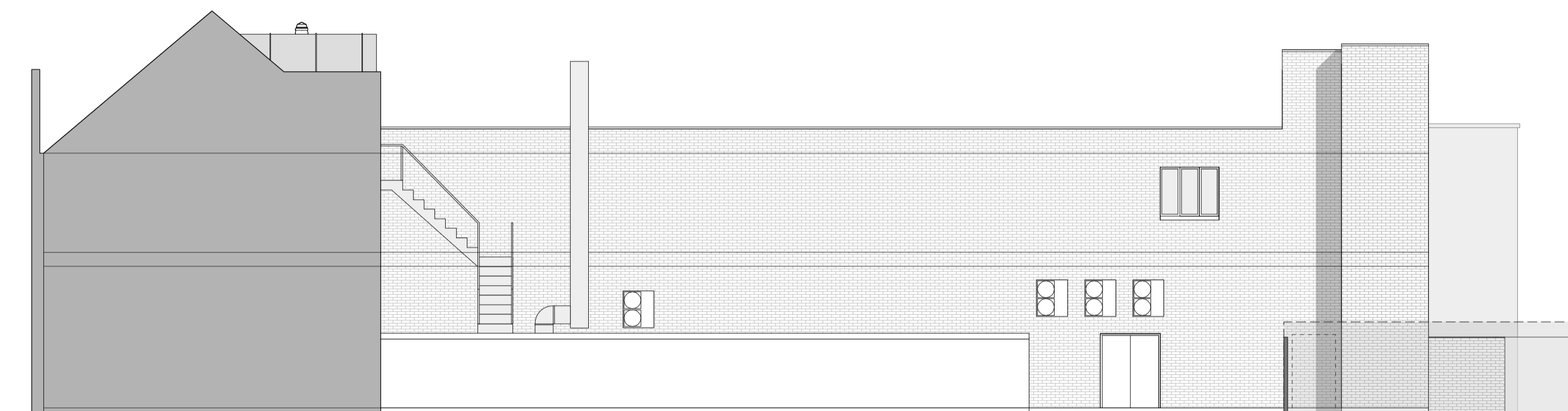
11 Flank (Northwest) Scale: 1:100