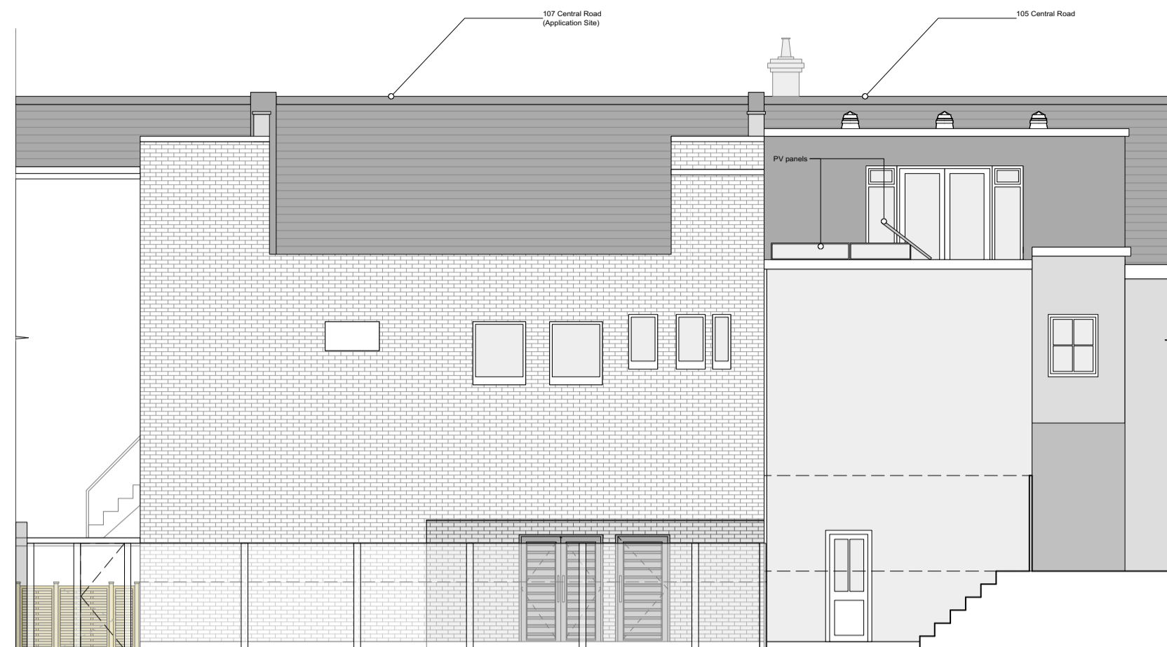
10 Rear (View from Lotus House) Scale: 1:100