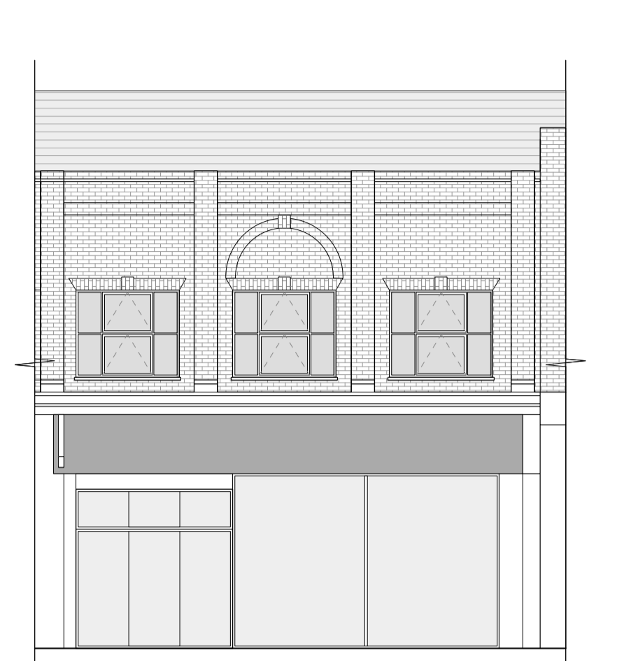
9 Front (View Along Central Road) Scale: 1:100