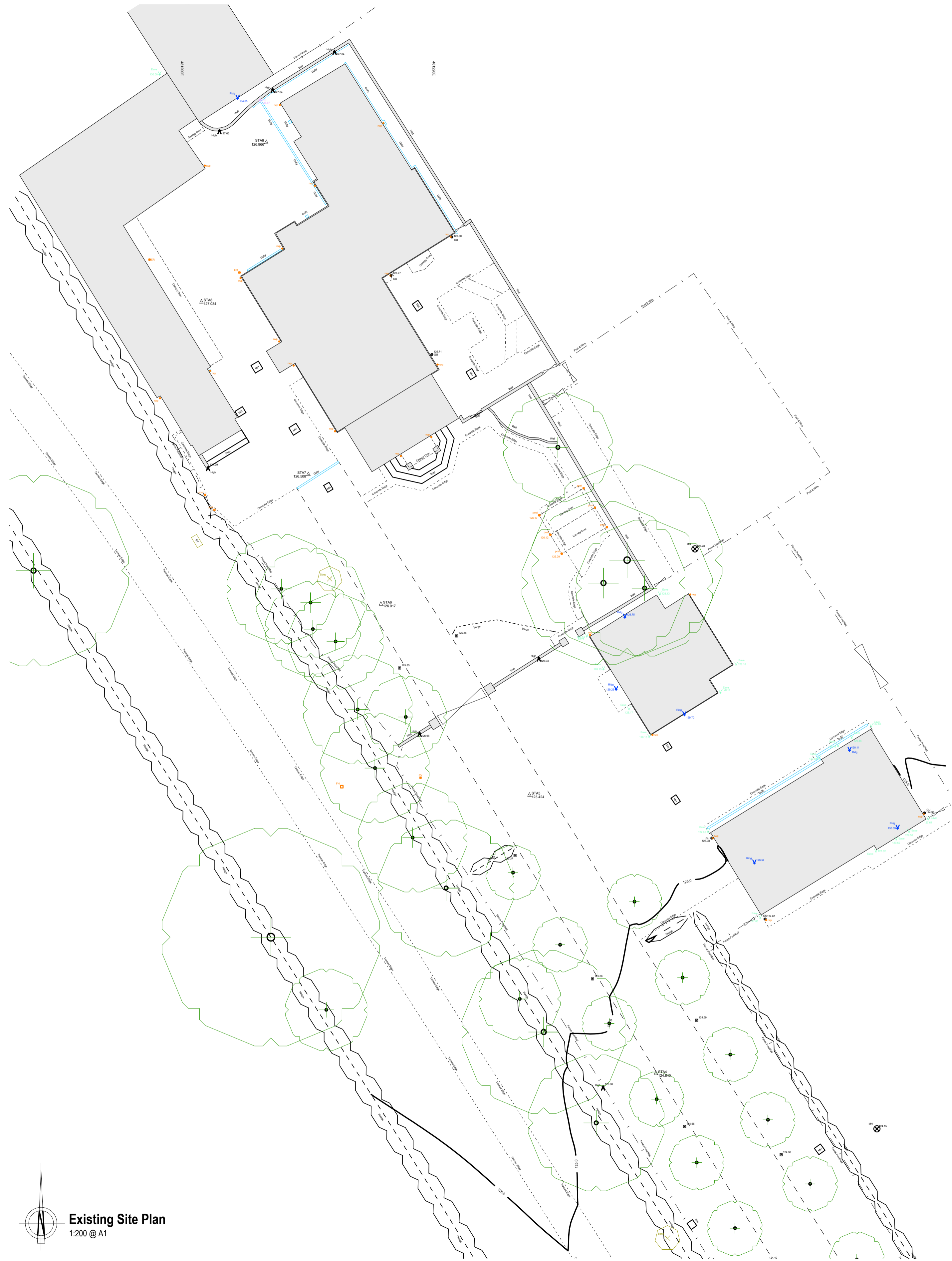
Existing Site Plan 1:200 @ A1

NOTES: • This drawing including all designs & detail contained thereon is the copyright of PW Architects & may not be reproduced or used except where written permission is granted. • This drawing may be used for Planning purposes only by the Local Planning Authority.