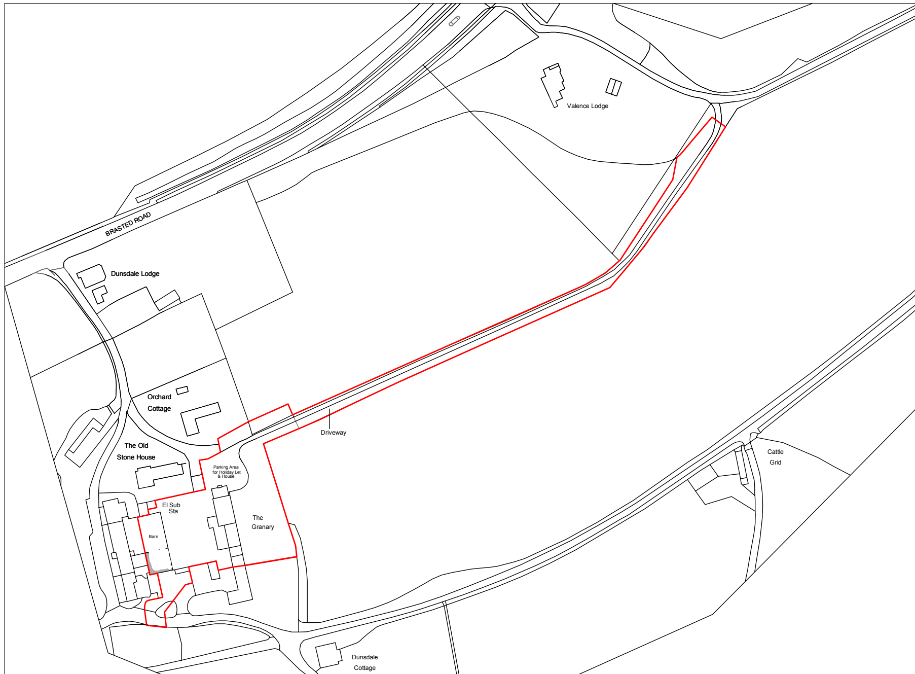
LOCATION & BLOCK PLAN