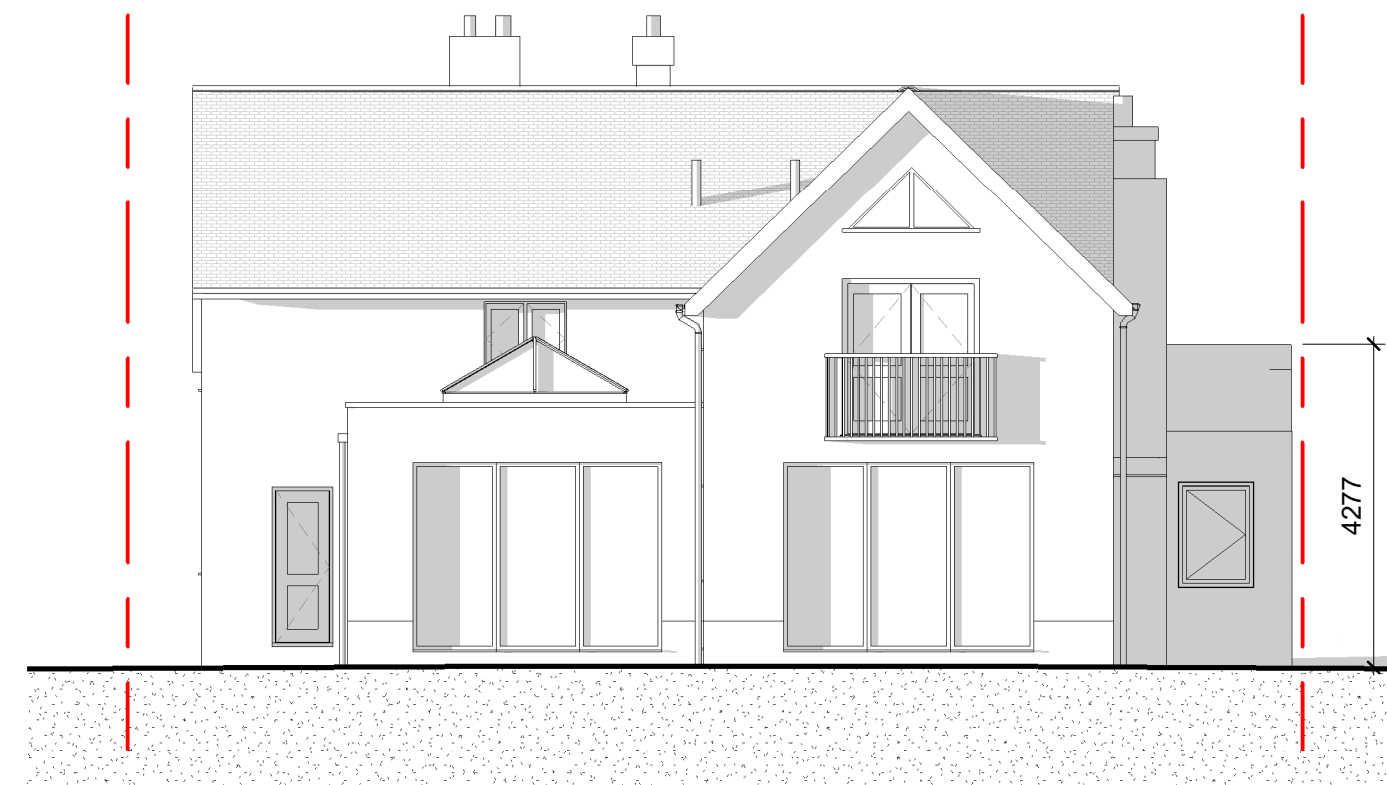
3 Rear (North) Elevation / Proposed 1:100