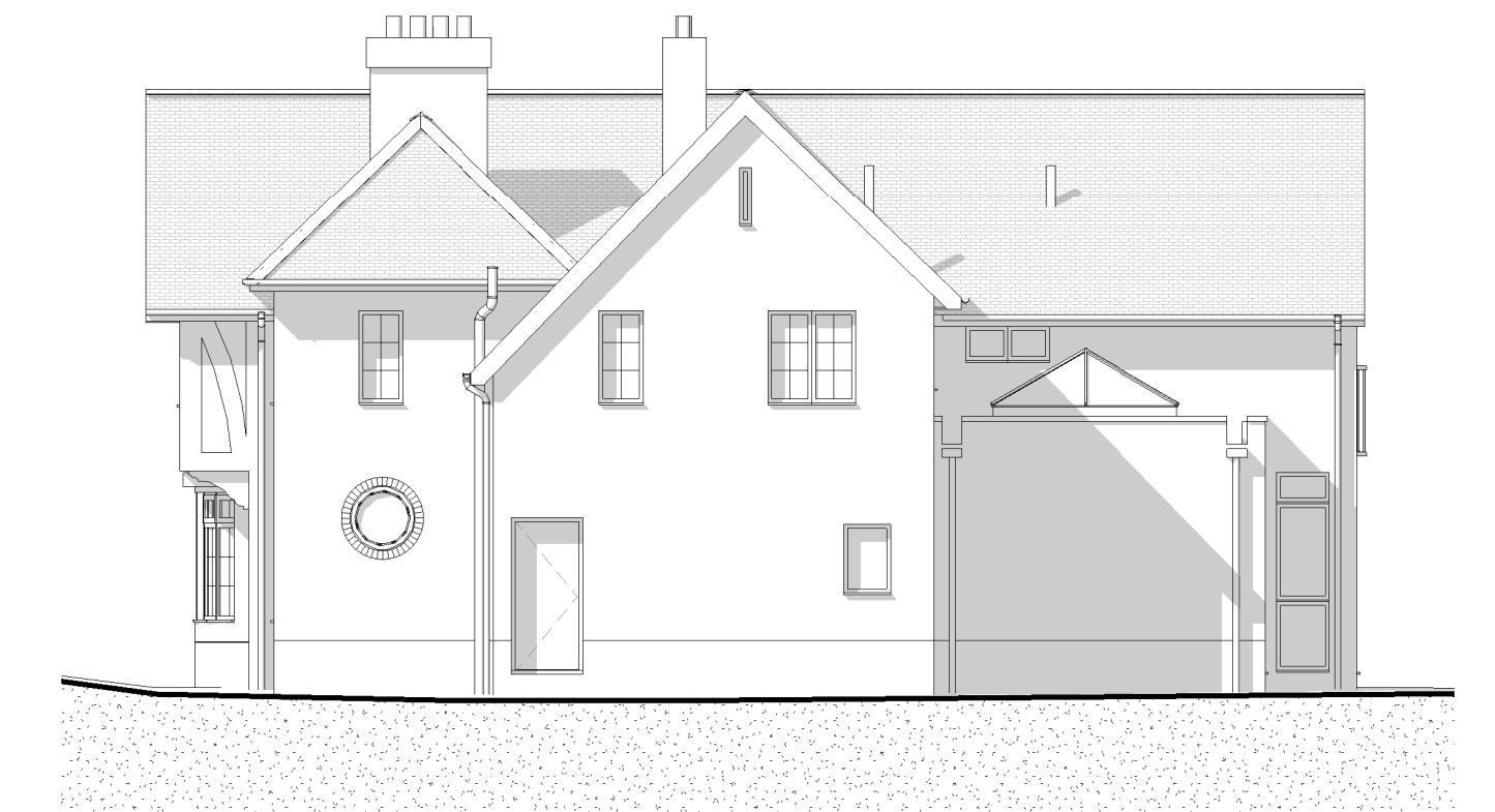
4 Side (East) Elevation / No Change 1:100

0m 2m 4m 6m 8m 10m VISUAL SCALE 1:100 @ A1