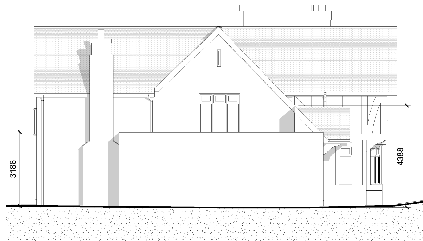
2 Side (West) Elevation / Proposed 1:100