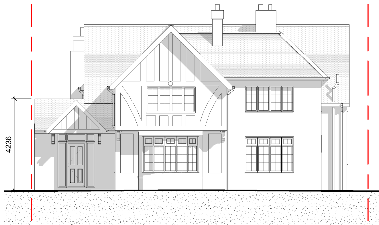
1 Front (South) Elevation / Proposed 1:100