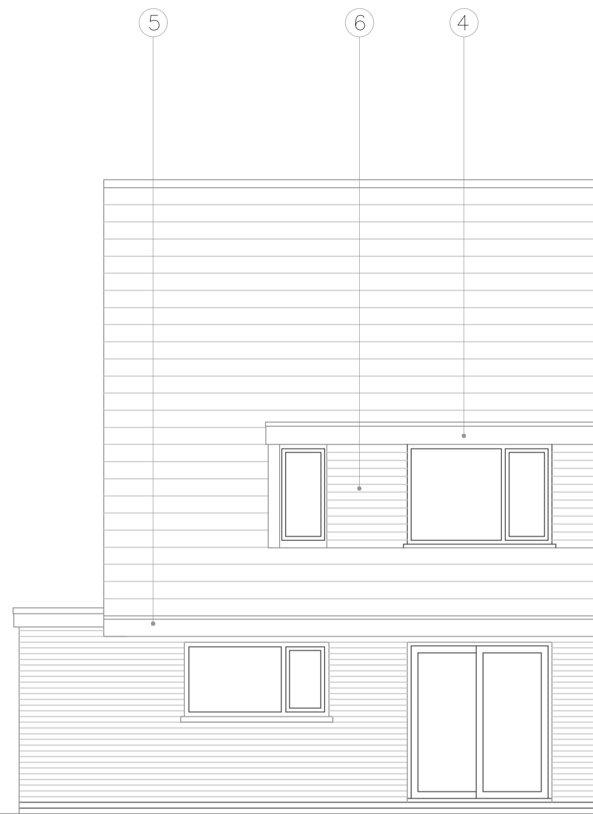
EXISTING REAR GARDEN ELEVATION Scale 1:50