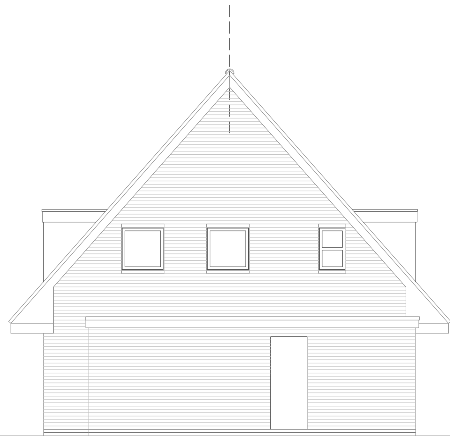
EXISTING SIDE ELEVATION Scale 1:50