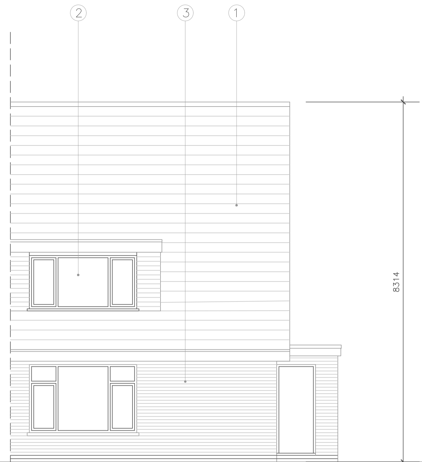
EXISTING FRONT STREET ELEVATION Scale 1:50